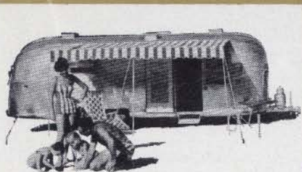
Airstream—since 1932 the world's finest lightweight travel trailers

Here's the lightest trailer of its size in the world. It's a big, roomy, luxurious 4-wheel tandem, yet it can be towed easily by any car. Recently it has been road-tested at over 90 miles per hour by an impartial automotive magazine. You may not want to go this fast—but the important fact is that the Sovereign of the Road tows like a dream behind your car at any speed. This great Airstream is your true “home away from home”—designed for glorious living and traveling comfort. It has the most amazing interior you've ever seen... a big, big living room, worlds of closet and drawer space, wonderful beds, special compartments—and to top it all, a great big bathroom with a good-sized bathtub, shower, basin and separate toilet. Add to this a convenient galley with extra large working area, a spacious combination refrigerator, deluxe stove, plus many other great Airstream features—and you have the last word in liveability. Remember, too, all the genius of Airstream design, all the experience of extensive road testing have gone into building this great trailer. Wherever you stay, you will enjoy living in it... wherever you go, you will enjoy taking it with you.