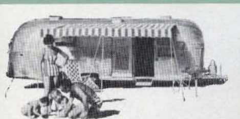
Airstream—since 1932 the world's finest lightweight travel trailers

Here's a remarkable new model designed to meet the need for a compact, sturdy, go-anywhere trailer. Light on the hitch, light on the hills and comfortable inside, the Traveler is the perfect small home on wheels. You'll be amazed by how much convenience and livability has been incorporated in this small trailer. Just look at all these great features: a convenient front end with airfoam dinettes; combination ice-electric refrigerator; good-sized oven and stove, convenient formica galley top; flush toilet; large closet and storage area; wonderfully comfortable airfoam double bed—and many other exclusive Airstream features. We think that the Traveler is the world's finest small travel trailer—a "natural" for those who want a lightweight trailer to go places at a price you can afford. And remember, every Airstream is guaranteed for life... the good life... the life you should be leading now.