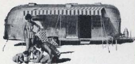
Airstream—since 1932 the world's finest lightweight travel trailers

Here's a fabulous new model that enables you to take all the "comforts of home" with you wherever you go. Travel to exciting new places in glorious comfort for extended periods of time. It's easy, it's fun, it's economical in this sensational new Airstream. The Overlander is designed by travelers—to travel. Every remarkable feature has its origin in long travel-testing on Airstream trailer caravans all over the world. It's a genuine Airstream, lightweight but large with plenty of room for gracious living. Just consider these outstanding features—a large, lovely living room with attractive divan; a modern, large bathroom with tub, shower and toilet; wonderfully comfortable beds in twin or double bed models; convenient galley with extra large working area; spacious combination refrigerator, deluxe stove—and many other great Airstream features too. See this great big wonderful world and travel care-free in an Airstream Overlander—the trailer that makes your travel dreams come true.