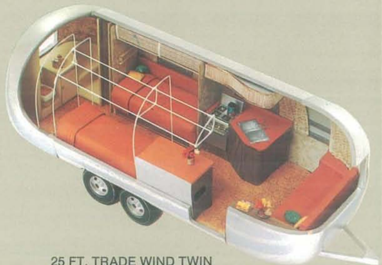
25 FT. TRADE WIND TWIN (Land Yacht) Hitch Wt. 725 lbs. Total Wt. 4090 lbs.