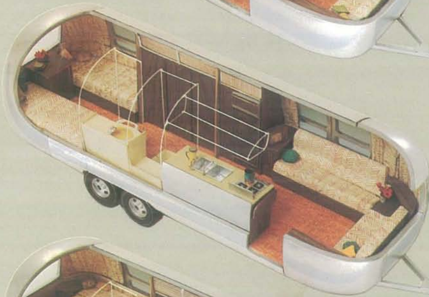
29 FT. AMBASSADOR TWIN CENTER BATH (Land Yacht) Hitch Wt. 720 lbs. Total Wt. 4790 lbs.