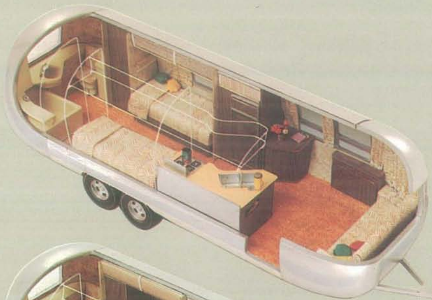
29 FT. AMBASSADOR TWIN REAR BATH (Land Yacht) Hitch Wt. 605 lbs. Total Wt. 4830 lbs.