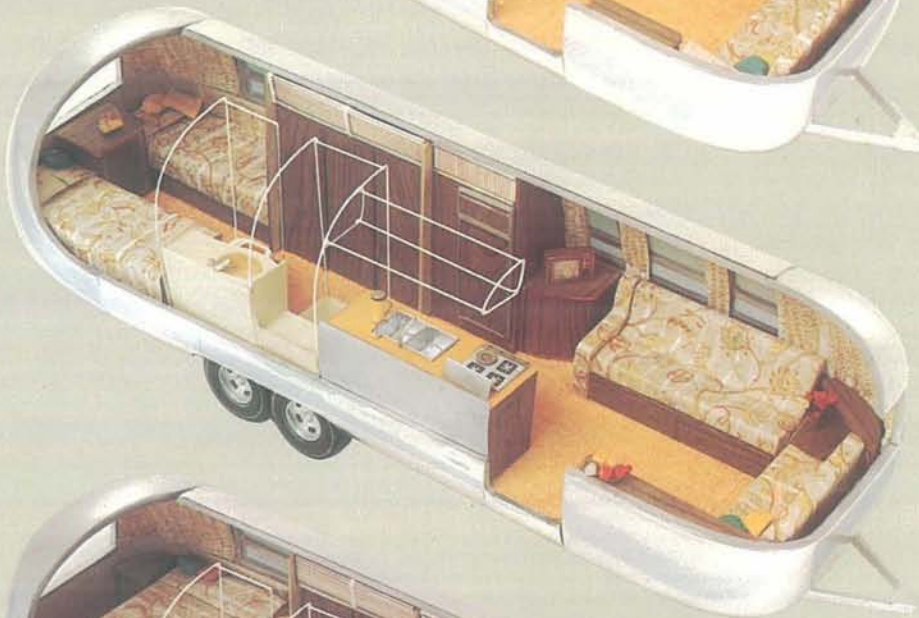
31 FT. SOVEREIGN TWIN CENTER BATH (Land Yacht) Hitch Wt. 710 lbs. Total Wt. 5025 lbs.