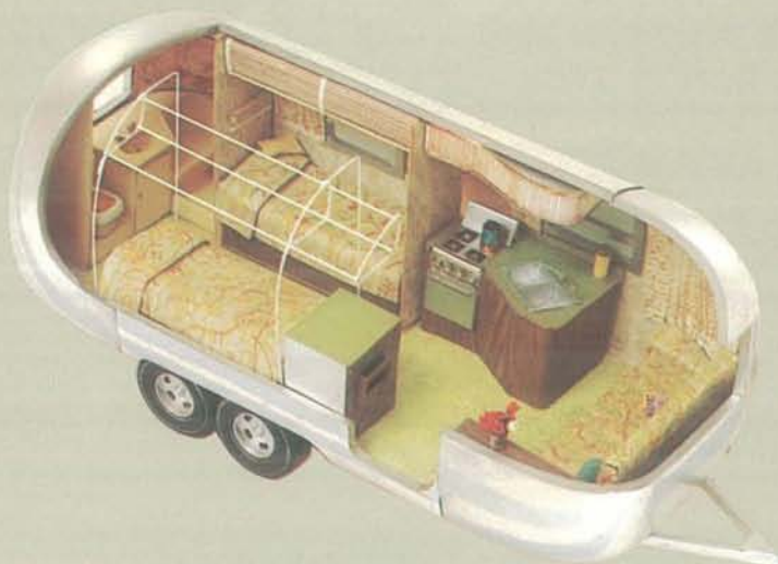
23 FT. SAFARI TWIN (Land Yacht) Hitch Wt. 750 lbs. Total Wt. 3800 lbs.