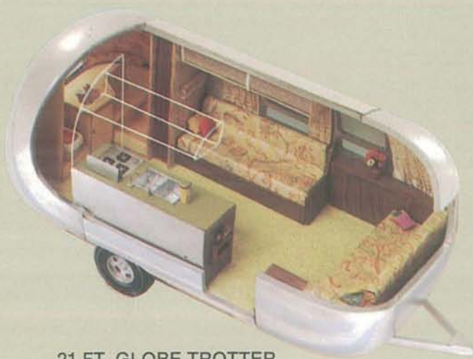
21 FT. GLOBE TROTTER (Land Yacht) Hitch Wt. 490 lbs. Total Wt. 3410

THE 1977 AIRSTREAM FLEET OFFERS YOU 16 EXCITING MODELS TO GIVE YOU TOTAL TRAVEL PLEASURE!