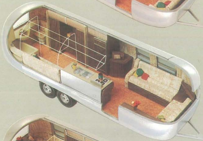
29 FT. AMBASSADOR DOUBLE REAR BATH (Land Yacht) Hitch Wt. 590 lbs. Total Wt. 4840 lbs.