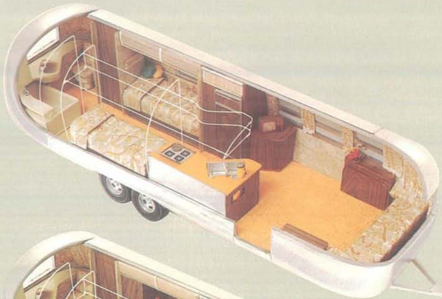
31 FT. SOVEREIGN TWIN REAR BATH (Land Yacht) Hitch Wt. 630 lbs. Total Wt. 5040 lbs.