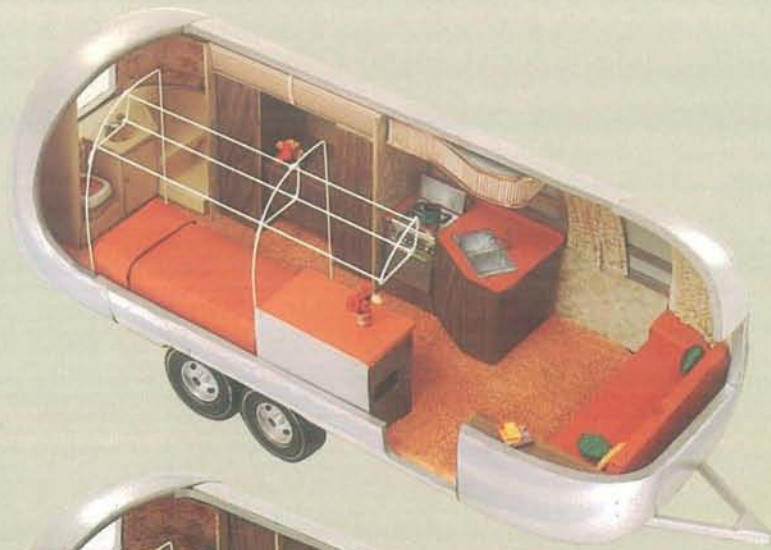
25 FT. TRADE WIND DOUBLE (Land Yacht) Hitch Wt. 735 lbs. Total Wt. 4175 lbs.