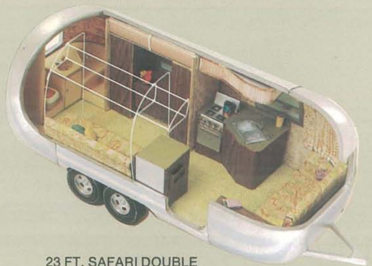
23 FT. SAFARI DOUBLE (Land Yacht) Hitch Wt. 745 lbs. Total Wt. 3850 lbs.