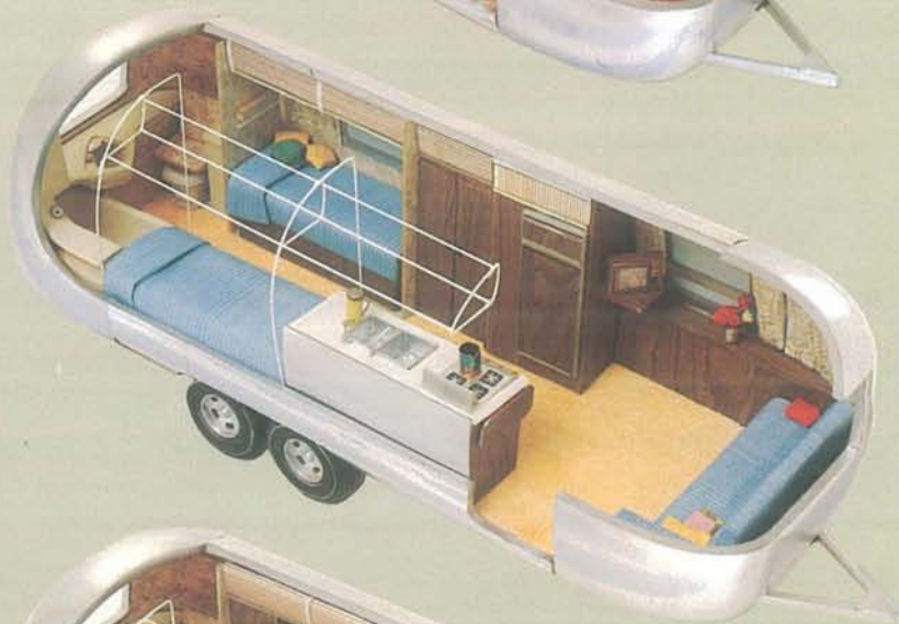
27 FT. OVERLANDER TWIN (Land Yacht) Hitch Wt. 590 lbs. Total Wt. 4520 lbs.