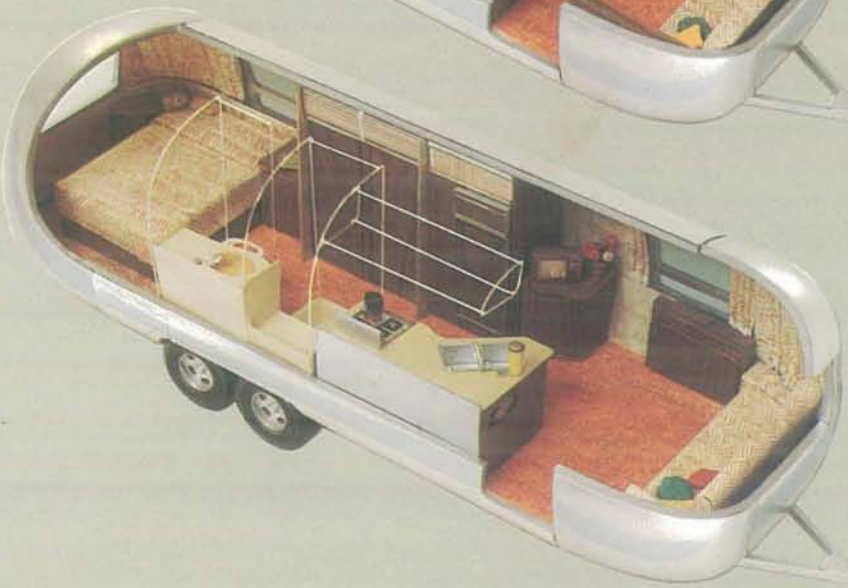
29 FT. AMBASSADOR DOUBLE CENTER BATH (Land Yacht) Hitch Wt. 725 lbs. Total Wt. 4775 lbs.