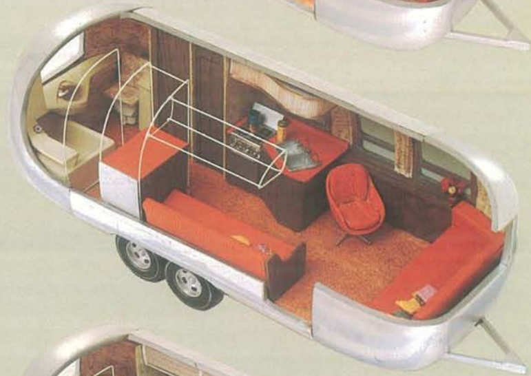
25 FT. CARAVANNER (Land Yacht) Hitch Wt. 580 lbs. Total Wt. 4435 lbs.