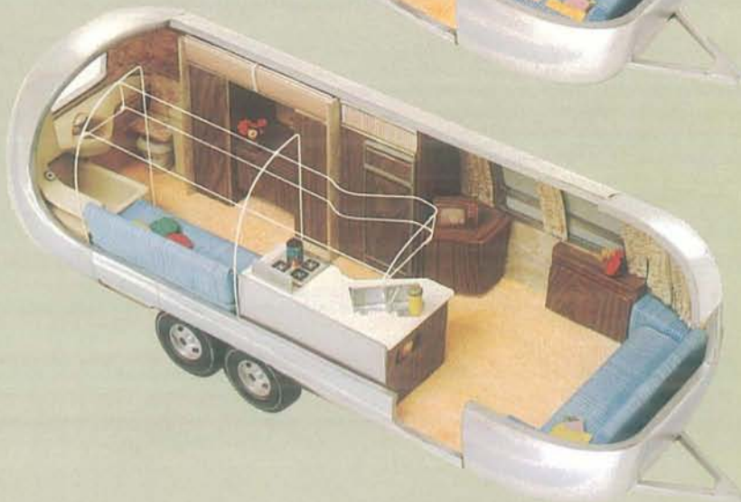
27 FT. OVERLANDER DOUBLE (Land Yacht) Hitch Wt. 570 lbs. Total Wt. 4550 lbs.