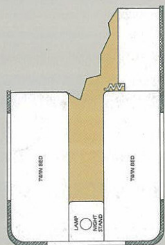
32 FOOT TWIN BED MODEL