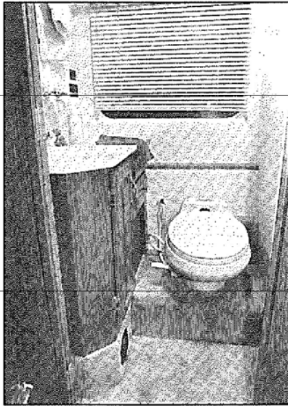
The compact but efficient lavatory includes a Corian countertop and fresh-water toilet.

and above-sink incandescent lights provide brilliant illumination in the bath. Toiletry storage space is ample. The top-quality Corian sink and counter, combined with oak cabinetry and brass-finish fixtures, give the area a classy image.