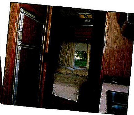
The fold-down table, located on the wall between the sofa and the curbside door, can be used as a desk or as a dining table for up to four people. Access to and egress from the corner bed require some agility of the inside sleeper.