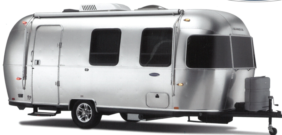
▼ 22FB Sport

Airstream, Inc. 419 West Pike Street Jackson Center, OH 45334 USA 937-596-6111 www.airstream.com