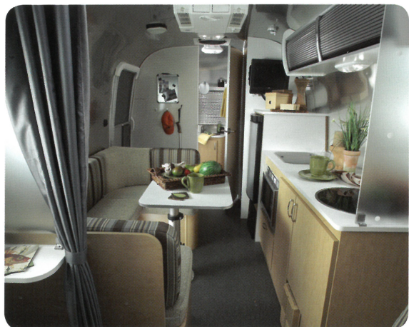
▲ 22FB Sport in Mochablue decor front-to-back