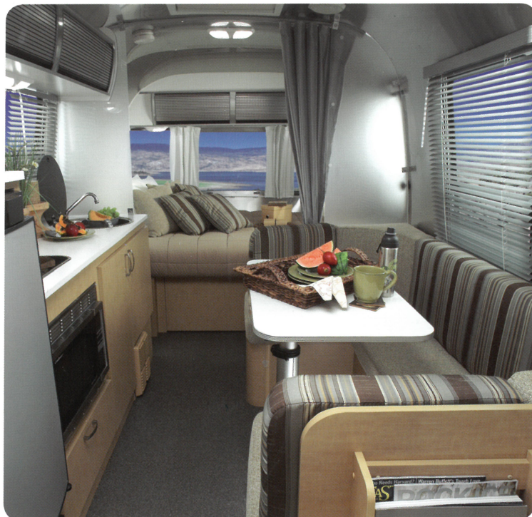
▲ 22FB Sport back-to-front in Mochablue decor

Warning - This information is intended as a guide only. Weights of individual vehicles may vary. Consult your owner's manual for complete loading, weighing, and towing instructions.