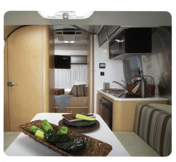
22FB Sport front-to-back in Mochablue decor