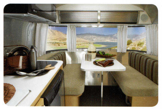
16 Sport convertible dinette in Mochablue decor