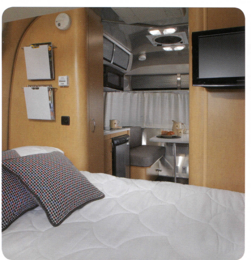
16 Sport back-to-front in Sharksfin decor

So choose your floorplan, choose your decor, and then choose your destination. Whether it's a week of canoeing in Minnesota's Boundary Waters or three nights of music at California's Monterey Jazz Festival, you'll enjoy all the comforts of home no matter how far the road takes you. The Airstream Sport offers nothing less than a personal declaration of independence. So get out there – your adventure awaits!