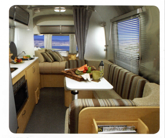
22FB Sport back-to-front in Mochablue decor