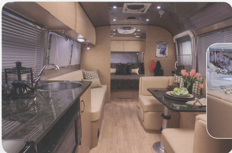
Flying Cloud 30FB Bunk in Golden Night Décor and Golden Ultraleather Option