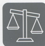
GVWR 8,200 lbs