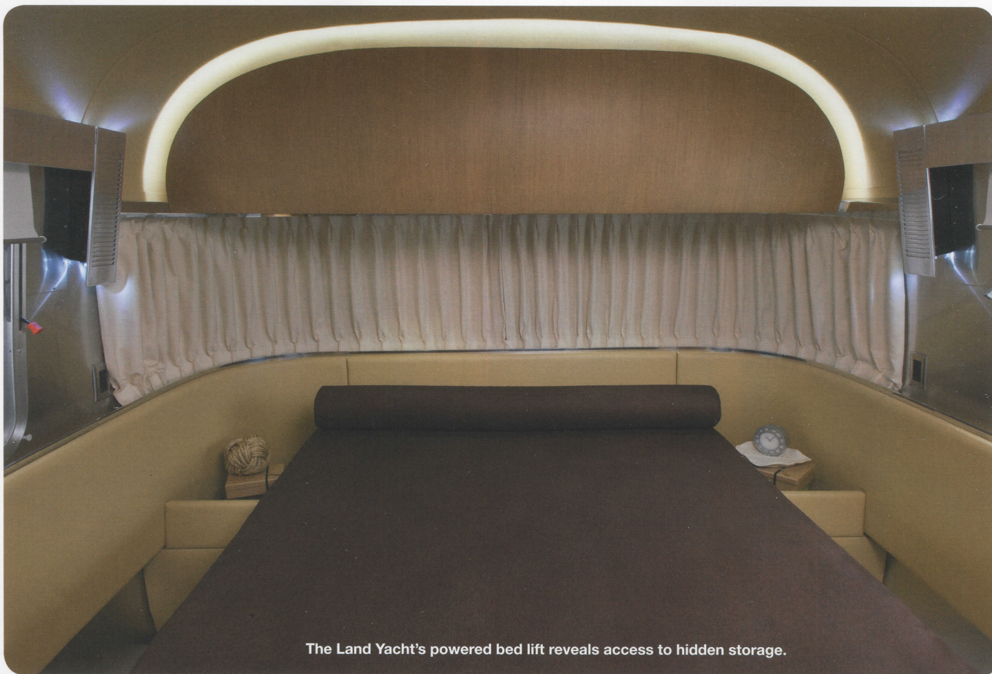
The Land Yacht's powered bed lift reveals access to hidden storage.

Product information, specifications, and photography in this brochure were as accurate as possible at time of printing. Photographs may contain some features that are optional on your vehicle. Since we continually strive to improve our products, actual products may differ. Prices and specifications are subject to change without notice. All capacities are approximate and dimensions are nominal. Some features or options may be different or unavailable in Canada.