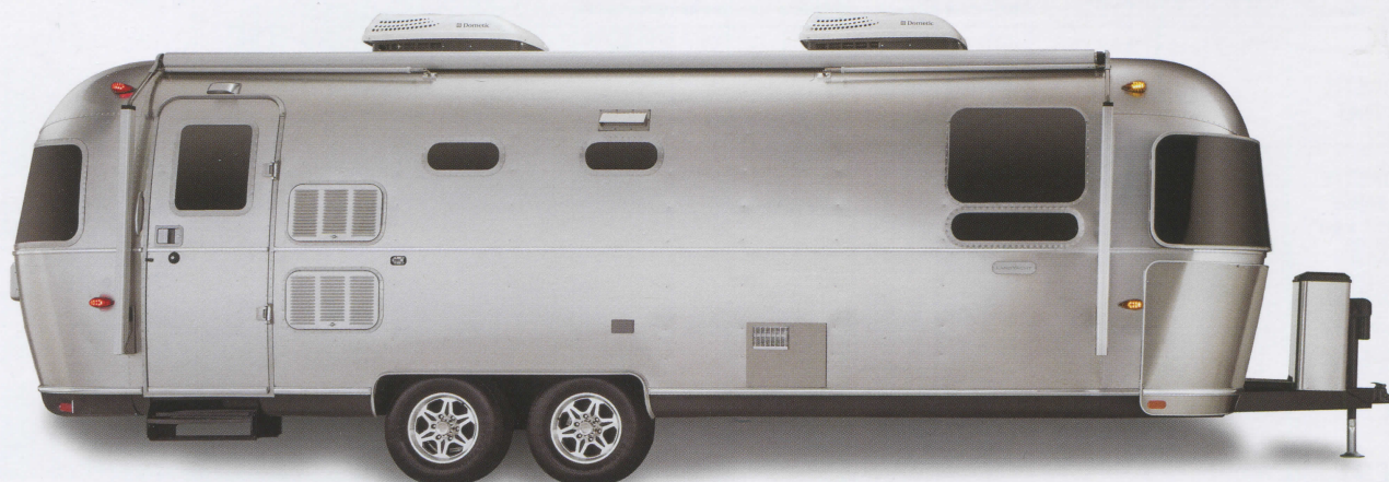
28FB LAND YACHT

The most luxurious Airstream ever conceived.