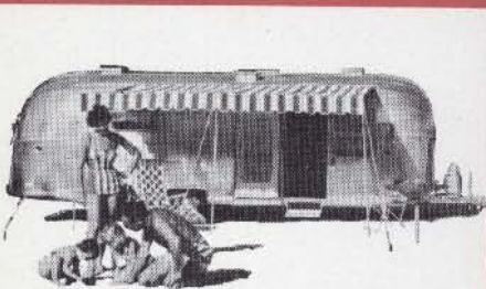
Airstream—since 1932 the world's finest lightweight travel trailers

Spectacular new features have been added to this great Airstream favorite . . . all designed to give you the utmost in faster, safer, more comfortable travel. It's unusually lightweight and compact, yet offers remarkable spaciousness for all your travel-living needs. You'll be captivated by the Flying Cloud's ingenious interior arrangement and numerous "comfort" features . . . double bed or twin bed models with superbly comfortable mattresses; a great big new bathroom with separate shower and toilet; more closet, shelf and drawer space; double sink and lots of formica for greater appeal and convenience; oven and broiler stove; combination ice-electric refrigerator—many other exciting features, too. If you want to travel, if you want modern styling, convenience and durability, be sure to see and test-ride this great new Flying Cloud. You're on your way to a new world of travel-adventure.