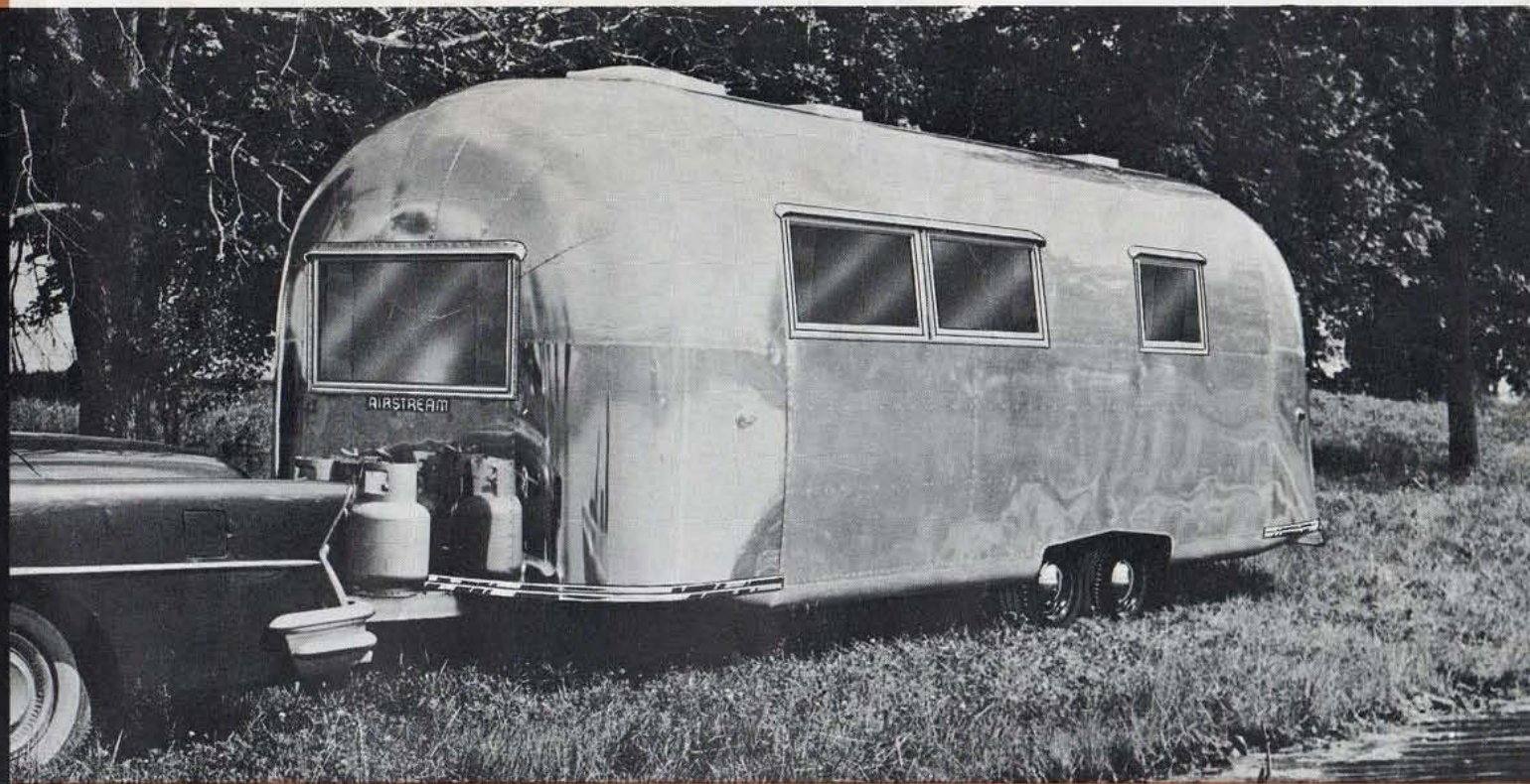
Tandem wheels shown, optional at extra cost.

airstream's pre-eminence in travel trailers is unsurpassed by any product in any industry. When you own an airstream, you know . . . and the world knows . . . you own the finest travel trailer built.