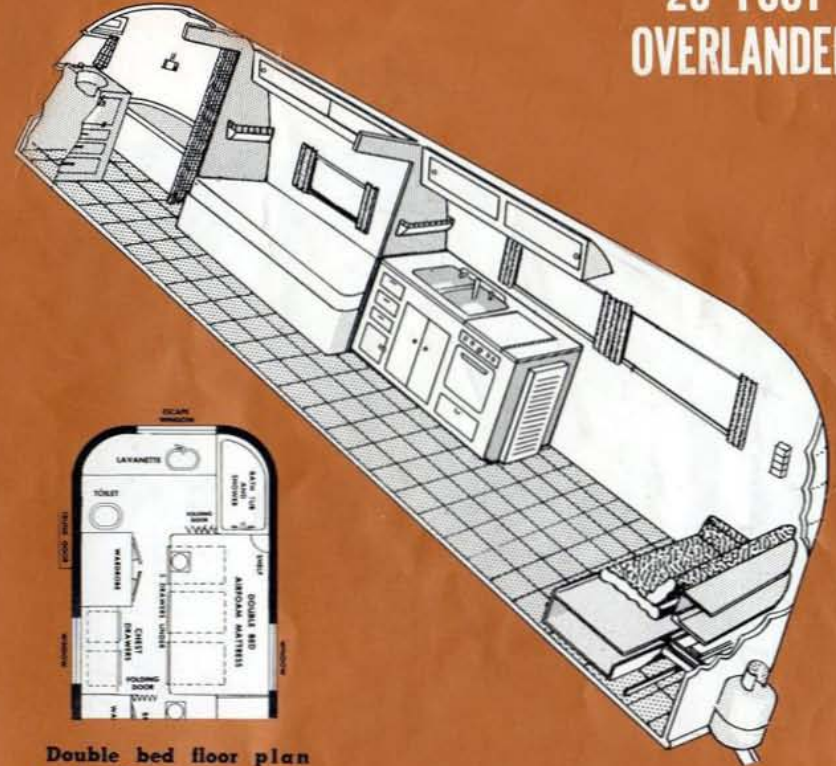
Double bed floor plan optional at no extra cost.