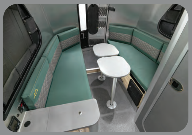
Leave the aisle open, or set up two easily-stowed tables

Basecamp's redesigned bedding area is more flexible than ever, and quickly converts to whatever seating arrangement your desire. When you're ready to rest, convert the bench seating into one of several half-bed configurations or a full bed that covers the entire back of the travel trailer. Leave the aisle open for gear and walking space, or set up two swiveling, easily-stowed tables for working or eating.