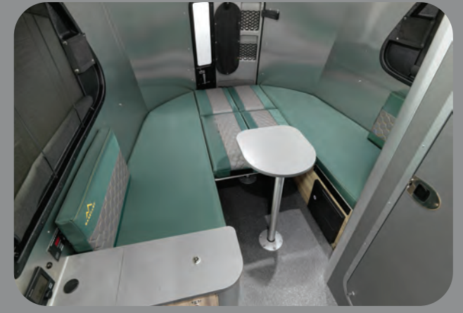
Create a half-bed lounge area with room for one table and seating