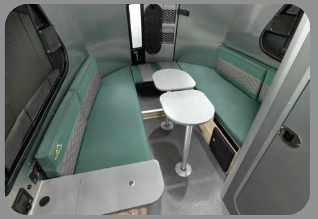
Small cushions allow for a U-dinette setup