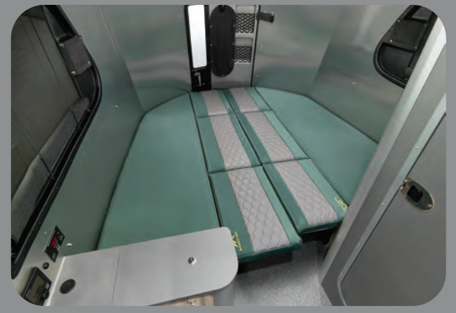
Tables serve as support for cushions in the full-bed configuration