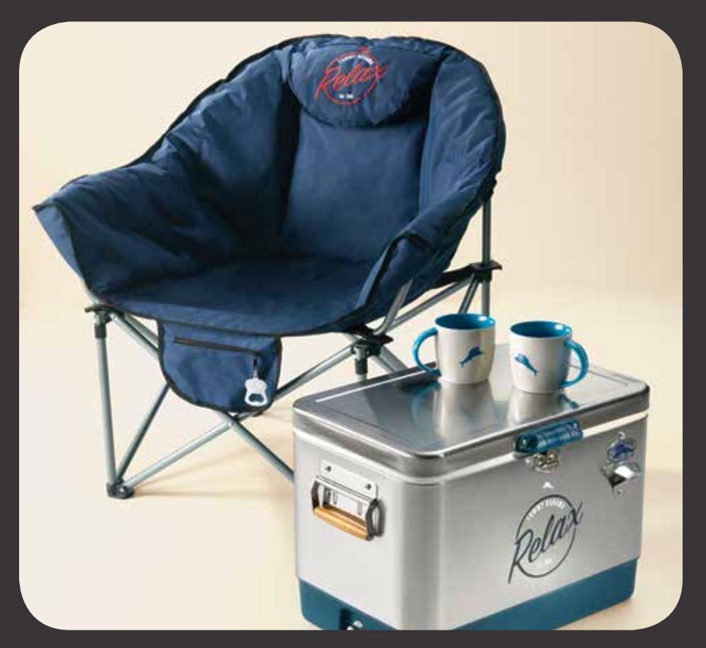
Get your newly laid back life started in style with the complimentary Tommy Bahama® cooler, chairs and Marlin mug set.