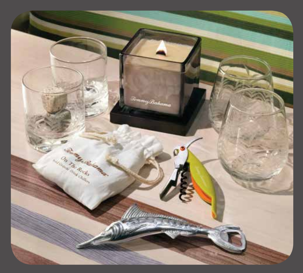
Relax, we've already set the mood with complimentary island-approved barware and a scented candle.

In addition to the eye-catching island patterns, colors and materials, the Tommy Bahama® Airstream Interstate is loaded with thoughtful features and creature comforts. With built-in bar storage, luxury woven vinyl flooring, Caribbean style matte finish cabinetry and custom plantation wood remote controlled blinds, you're 24 feet closer to the tropical beach house of your dreams.