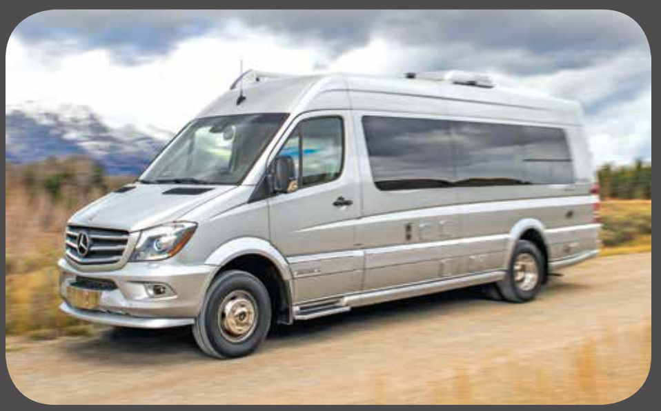
Optional on demand, four wheel drive maintains the utmost traction, stability, and control.