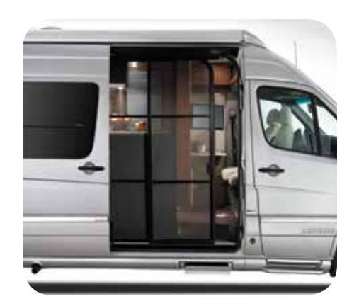
Grand Tour Side Screen Door