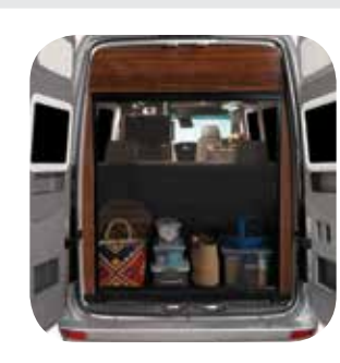
Rear Power Screen Door