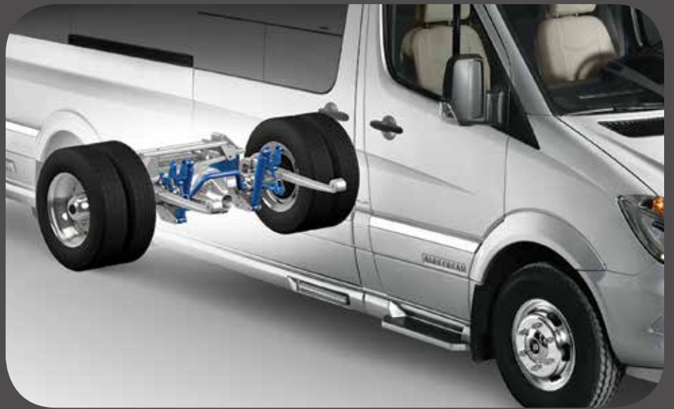
Optional air suspension system for improved drivability, stability, and comfort.