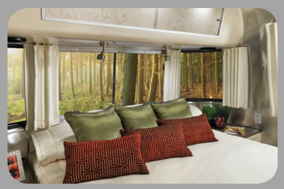
Sleeping in Serenity is as good as it sounds.