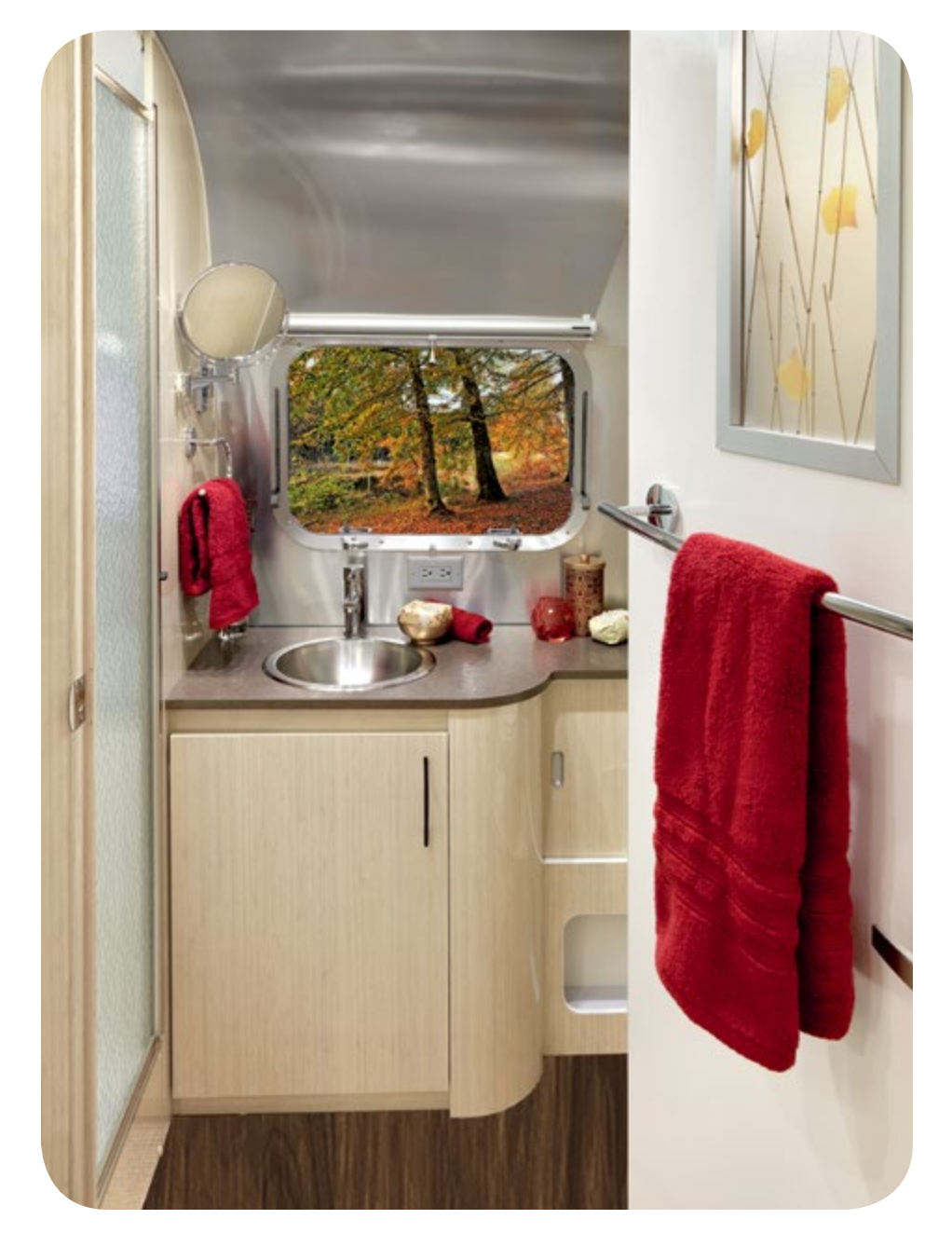
Soothingly spacious full bath.