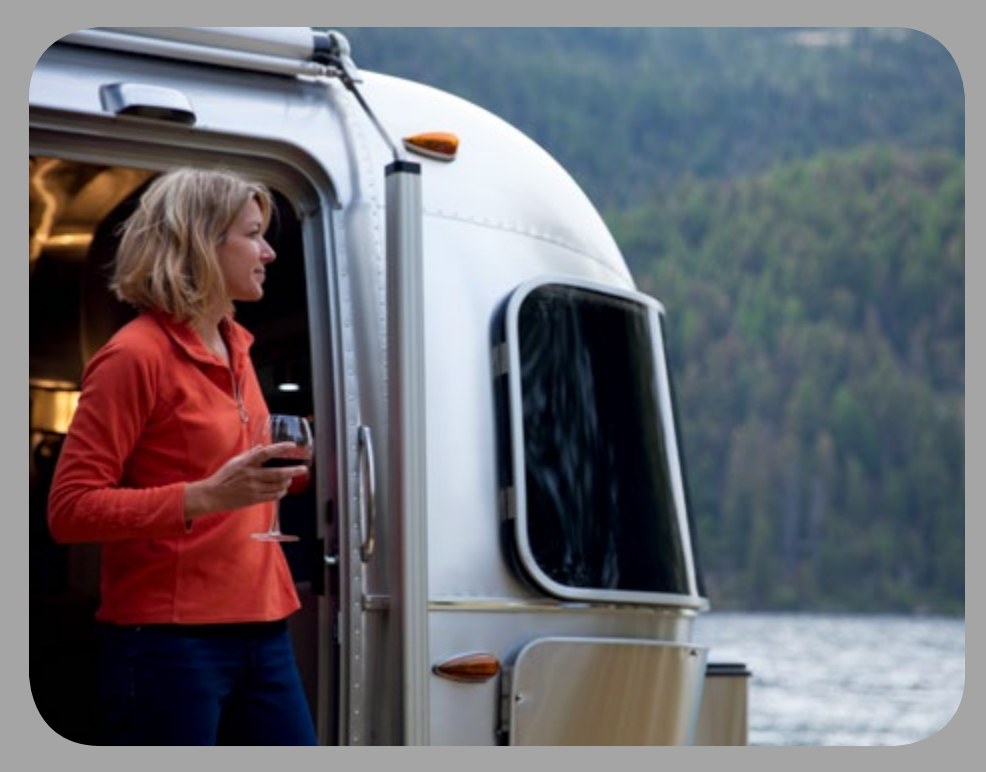
Traveling well means never missing a sunset.