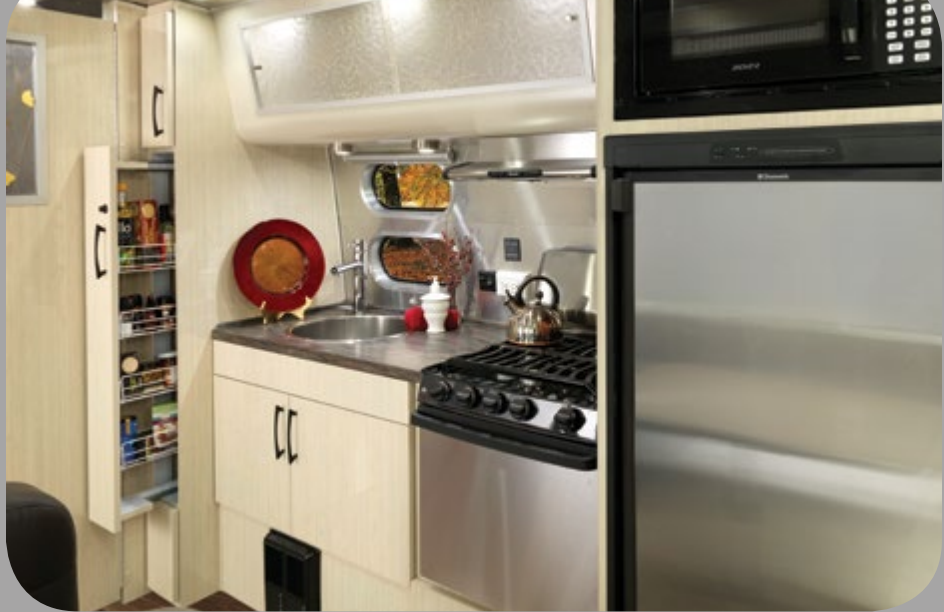
Space to stretch your cooking abilities.