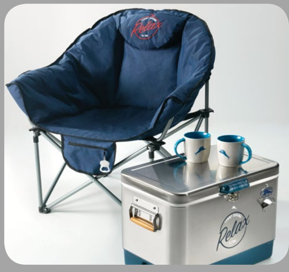
Get your newly laid back life started in style with the complimentary Tommy Bahama® cooler, chairs and Marlin mug set.