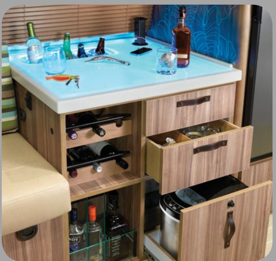
Great bar with a short walk home. (Shown with ice maker and backlit Dupont Corian® bar – 27FB model only.)

In addition to the eye-catching island patterns, colors and materials, our Tommy Bahama® trailer is loaded with thoughtful features and creature comforts. With a backlit Corian® bar (complete with ice cooler and stowaway ice maker), top of the line entertainment center with Polk® audio and custom plantation wood shutters and blinds, you're ready for the weekend of your life – or a lifelong weekend.