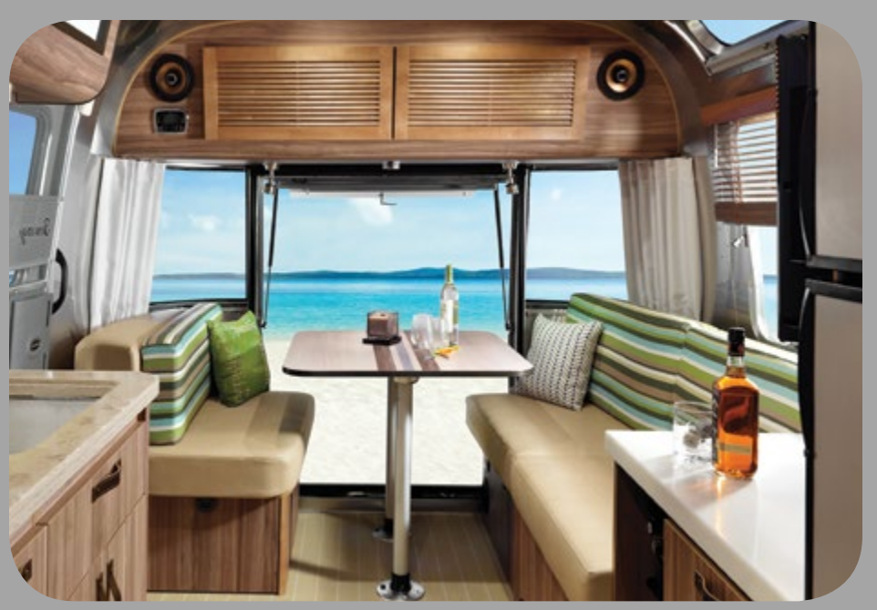
The comfortable dinette, which includes a rear hatch in the 27FB, means you'll enjoy open air dining without fear of a passing shower.