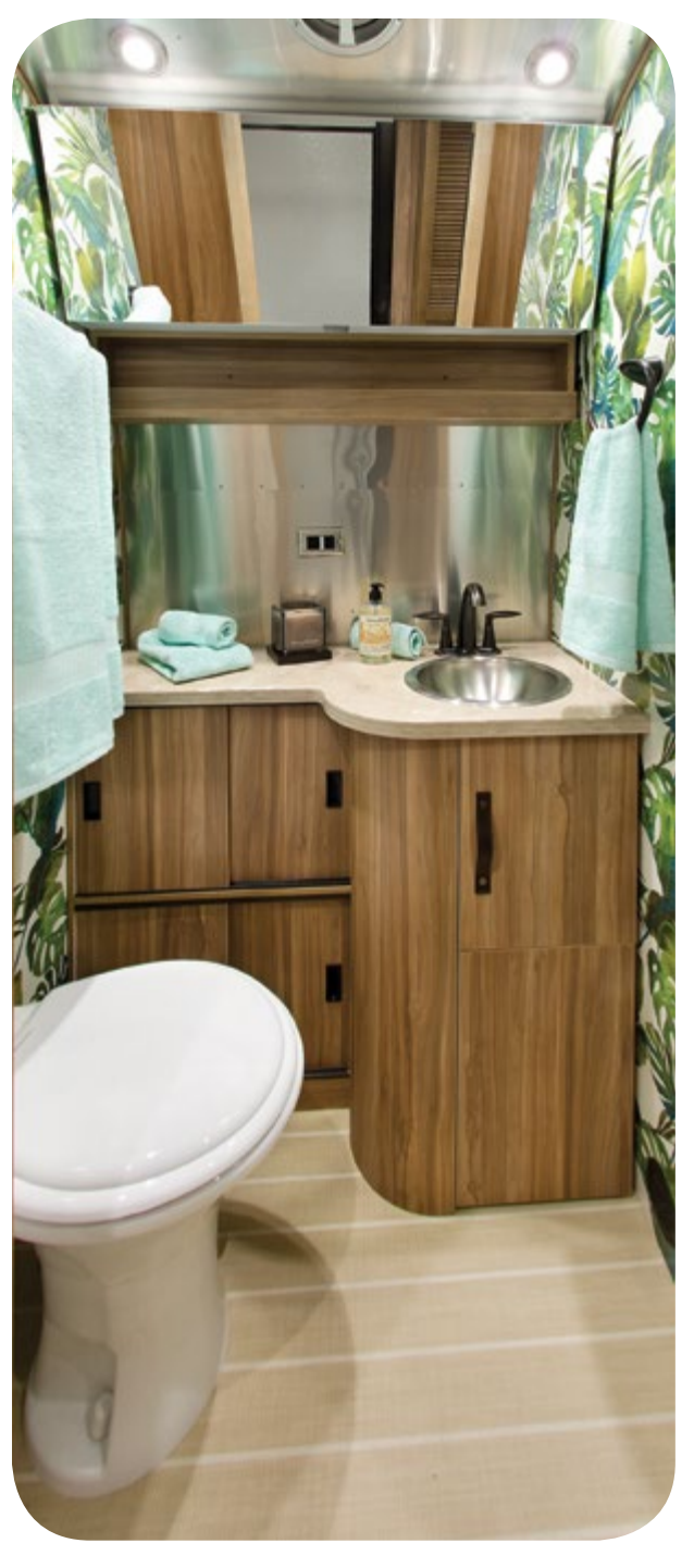
Indoor bath? Could have sworn we were outside.