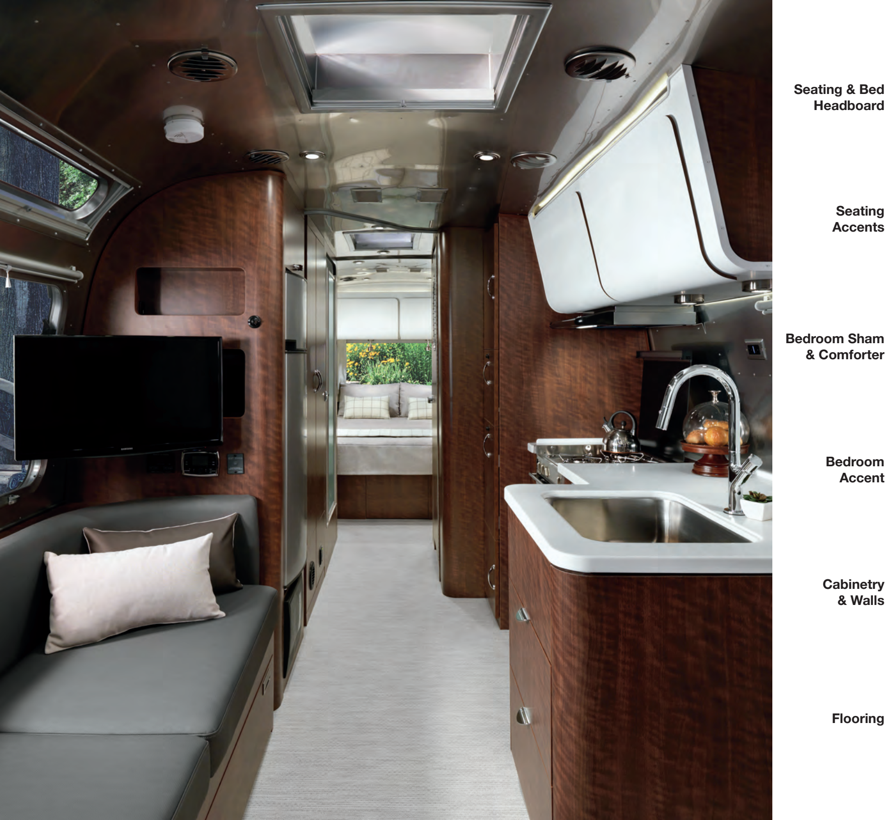
Seating & Bed Headboard