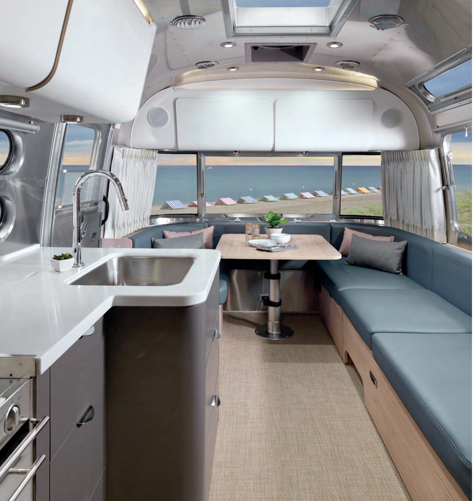
Seating & Bed Headboard