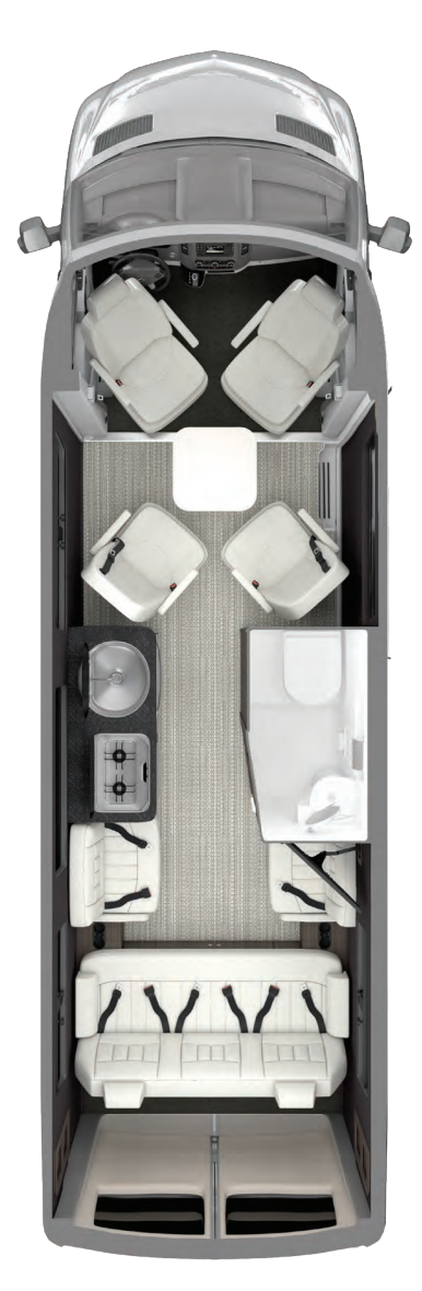
Interstate 24GL 4x2

In the Interstate 24GL, the fun doesn't have to wait to begin until you arrive at your destination, the fun begins the moment you step inside.