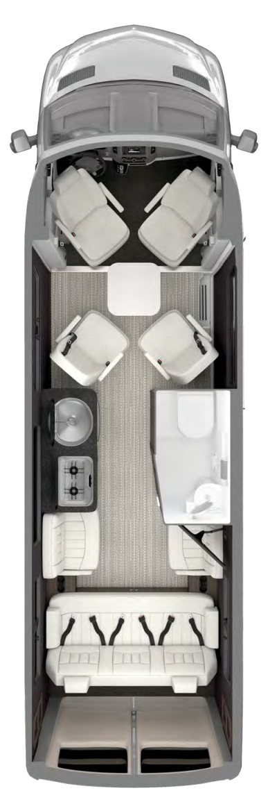
Interstate 24GL 4x4