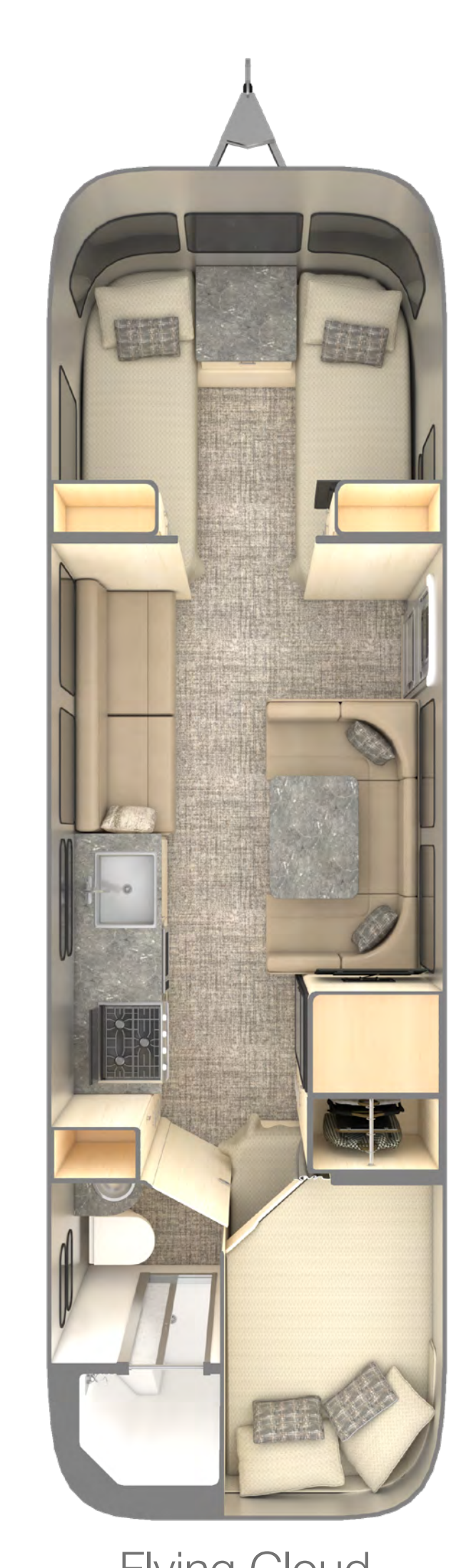
Flying Cloud 30FB Bunk Weight: 6,672 lbs. Exterior Length: 30 ft. 10 in