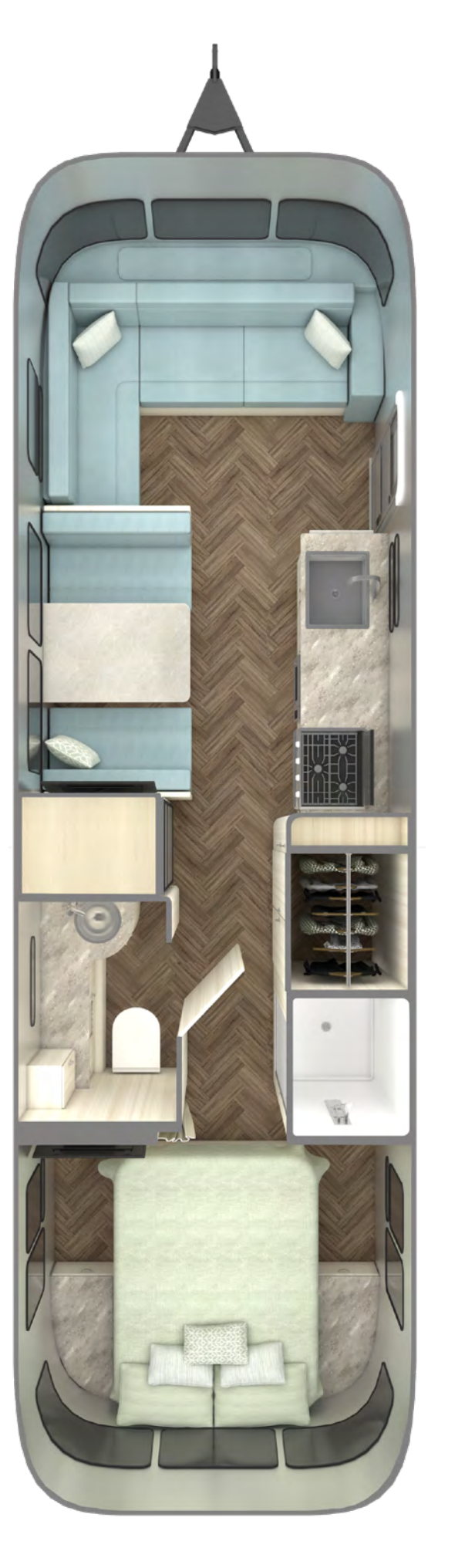
International 30RB Weight: 6,517 lbs. Exterior Length: 30 ft. 11 in.