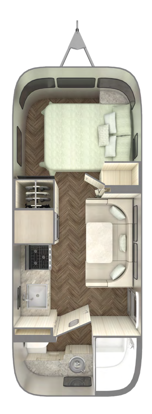
International 23FB Weight: 5,100 lbs. Exterior Length: 23 ft. 11 in.