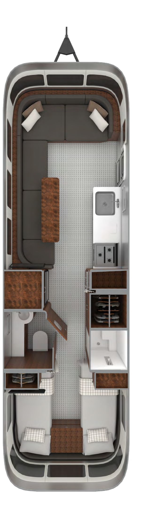
Globetrotter 30RB Weight: 6,925 lbs. Exterior Length: 31 ft. 2 in.