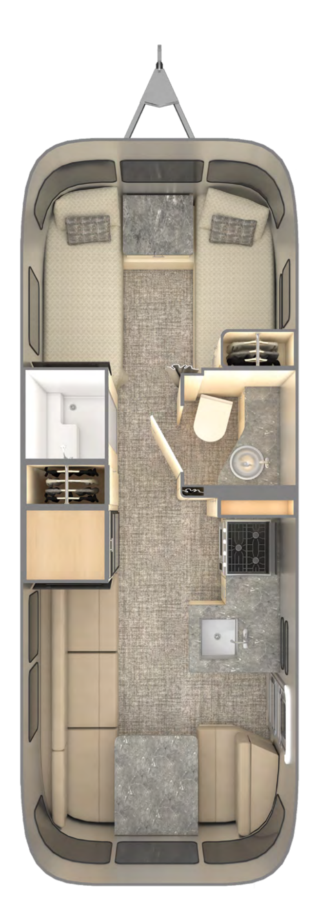
Flying Cloud 25FB Weight: 5,600 lbs. Exterior Length: 25 ft. 11 in.