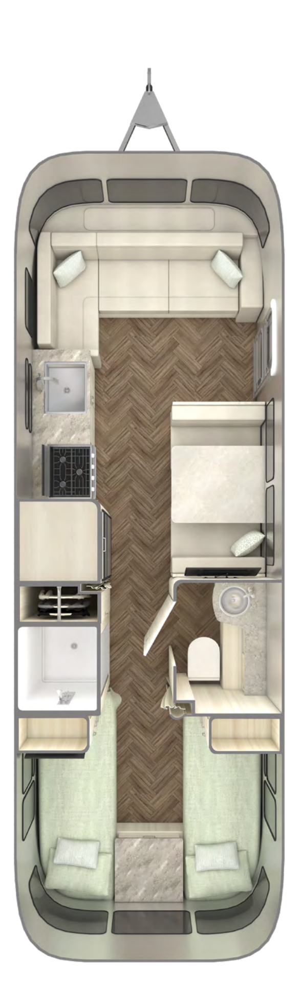
International 28RB Weight: 6,100 lbs. Exterior Length: 28 ft.