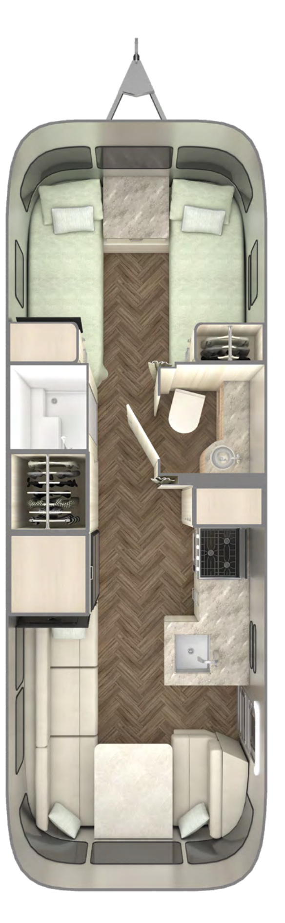
International 27FB Weight: 6,100 lbs. Exterior Length: 28 ft.