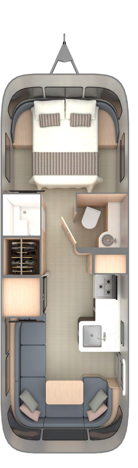
Globetrotter 27FB Weight: 6,300 lbs. Exterior Length: 28 ft.