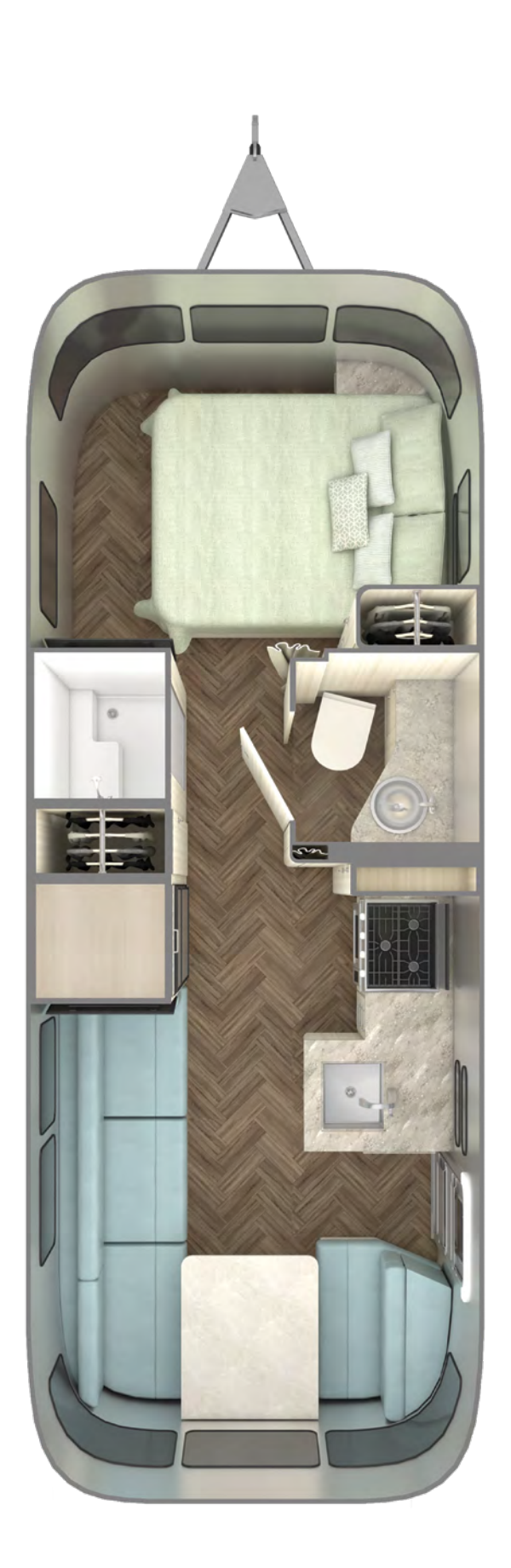
International 25FB Weight: 5,600 lbs. Exterior Length: 25 ft. 11 in.