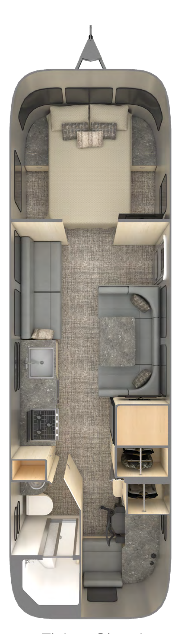
Flying Cloud 30FB Office Weight: 6,804 lbs. Exterior Length: 30 ft. 10 in.