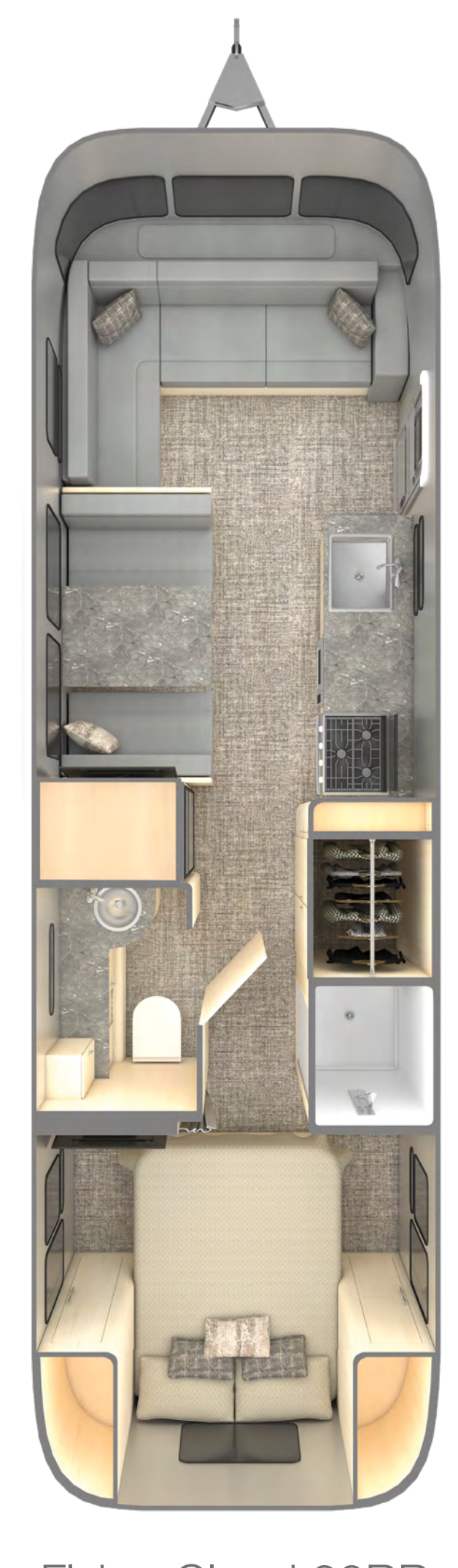
Flying Cloud 30RB Weight: 6,517 lbs. Exterior Length: 30 ft. 11 in.