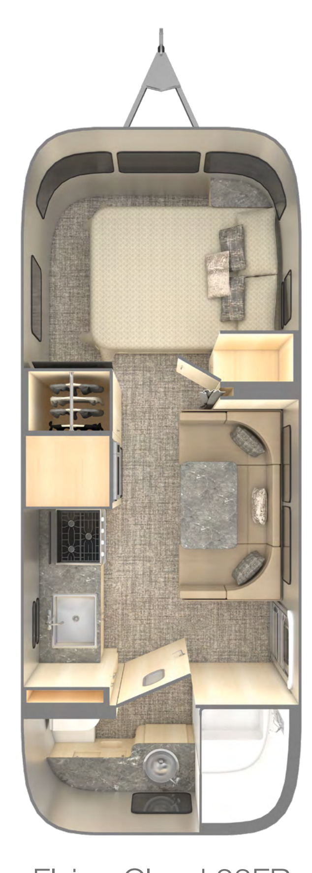
Flying Cloud 23FB Weight: 5,000 lbs. Exterior Length: 23 ft. 9 in.