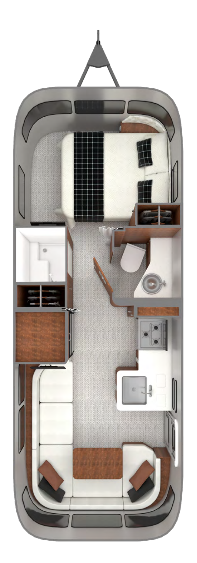
Globetrotter 25FB Weight: 6,100 lbs. Exterior Length: 25 ft. 11 in.