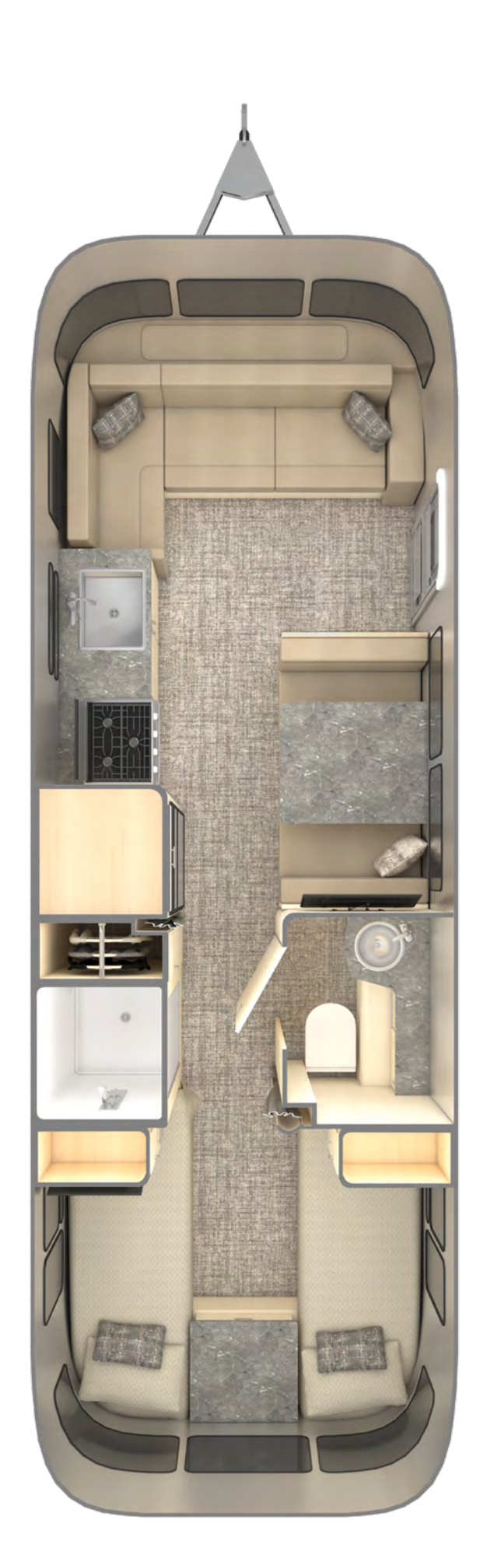
Flying Cloud 28RB Weight: 6,100 lbs. Exterior Length: 28 ft.