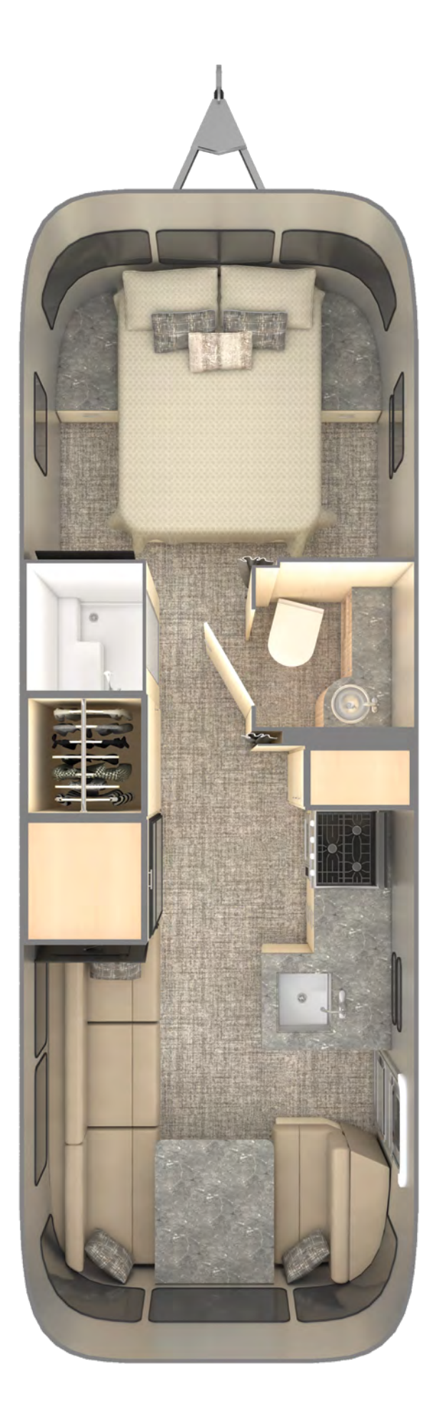
Flying Cloud 27FB Weight: 6,100 lbs. Exterior Length: 28 ft.