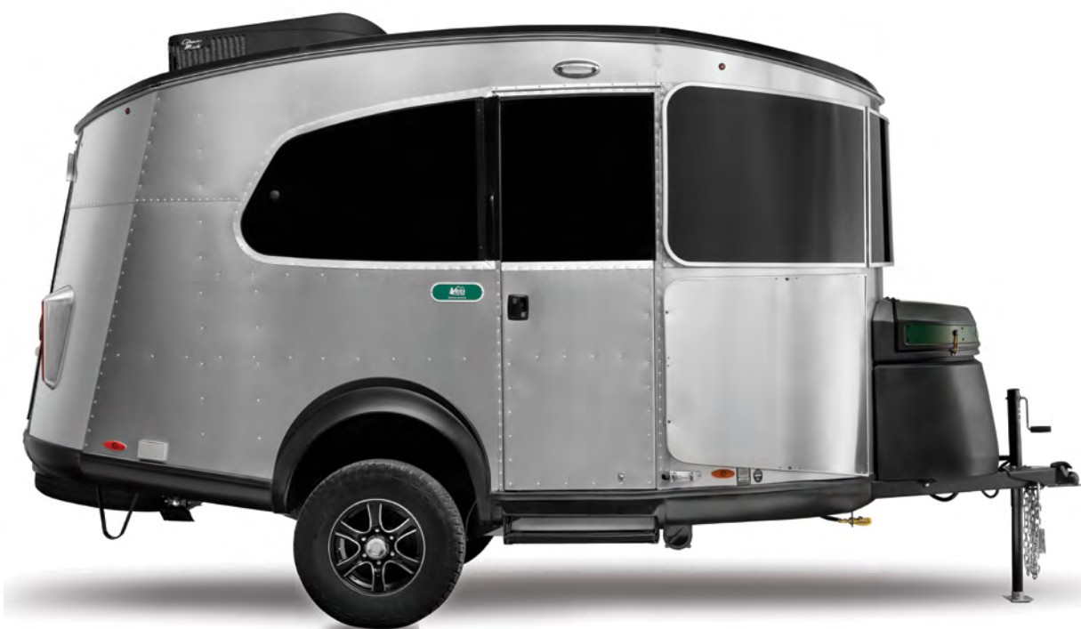
REI Co-op Special Edition Basecamp 16X