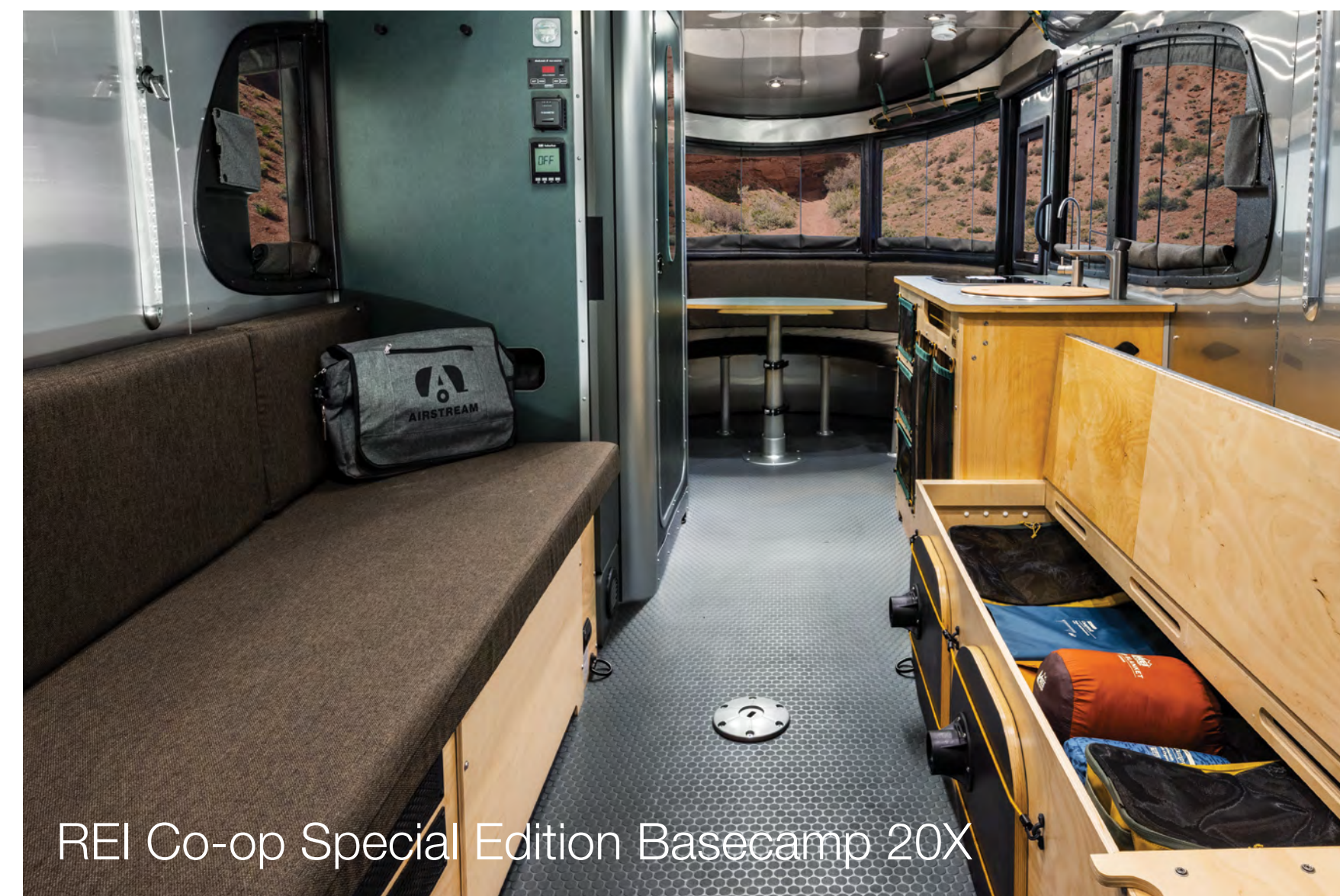
REI Co-op Special Edition Basecamp 20X