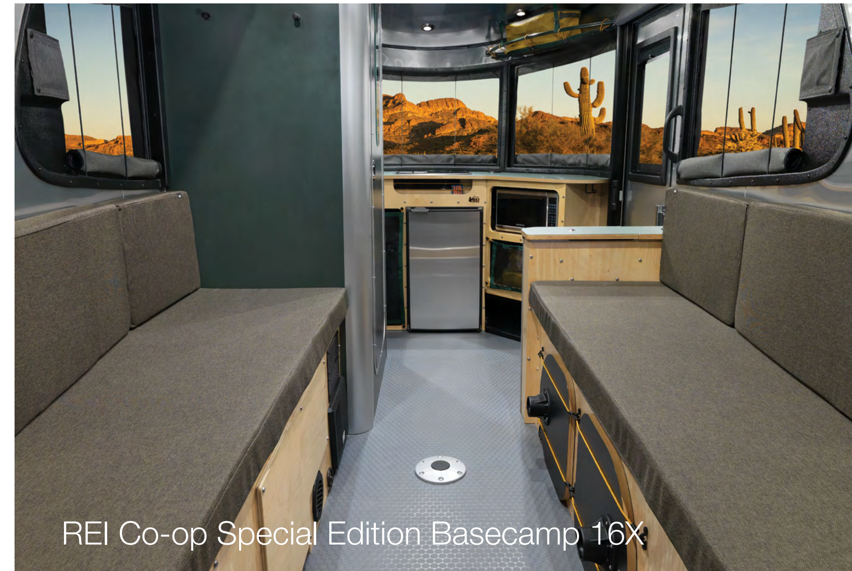
REI Co-op Special Edition Basecamp 16X