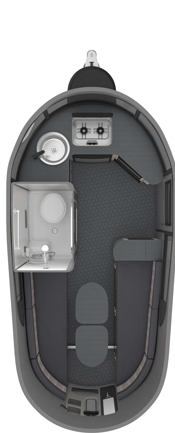
16 GWR: 3,500 lbs. Exterior Length: 16 ft. 2 in.