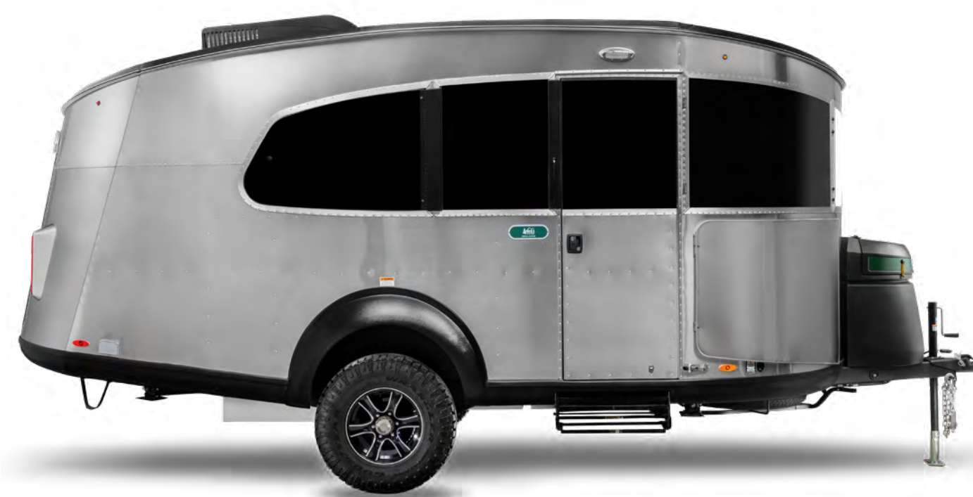
REI Co-op Special Edition Basecamp 20X