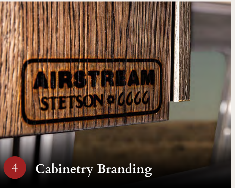
4 Cabinetry Branding Elegant design elements included throughout the interior