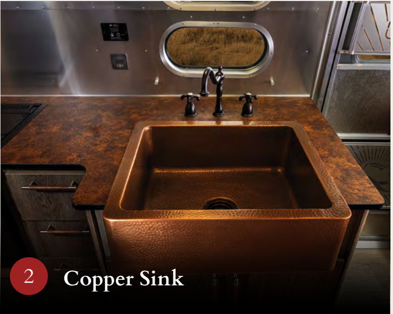
2 Copper Sink Handsome details and finishes contribute to the overall ambiance