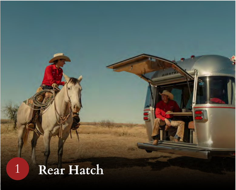
1 Rear Hatch