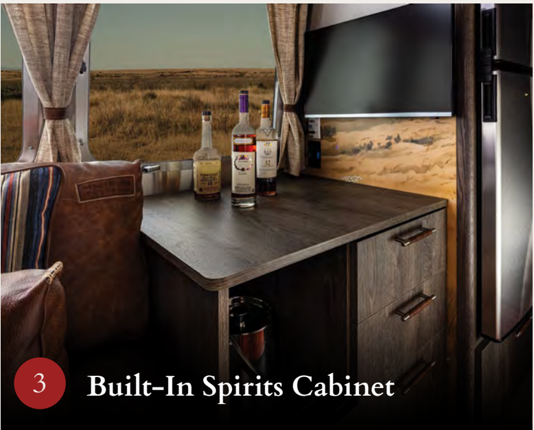
3 Built-In Spirits Cabinet Bring along your own personal watering hole