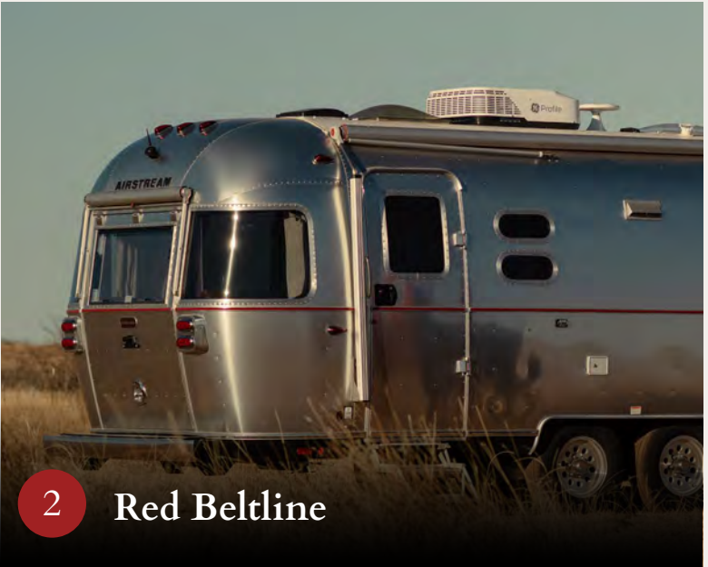
2 Red Beltline

A pop of color balanced with the traditional Airstream look