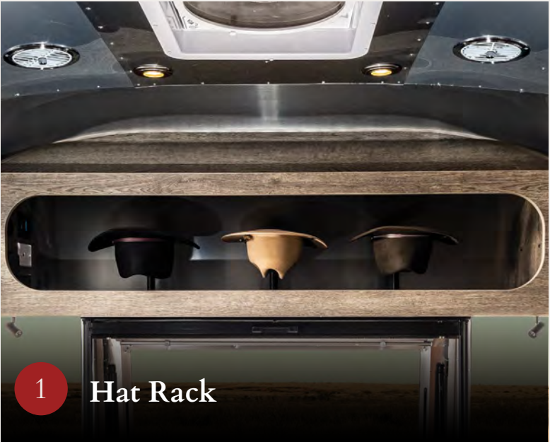
1 Hat Rack Authentic touches make this trailer genuine to its roots