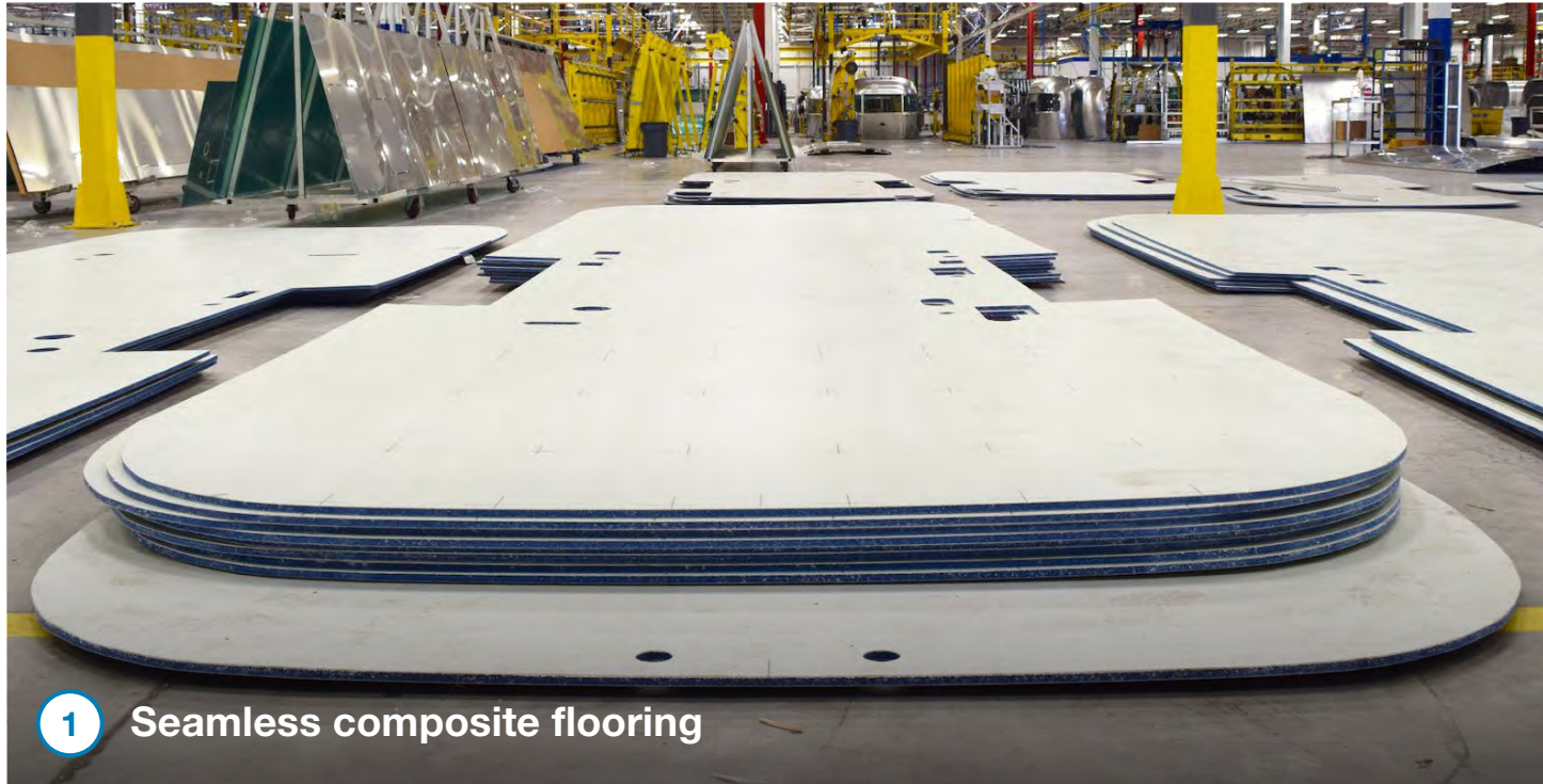
1 Seamless composite flooring