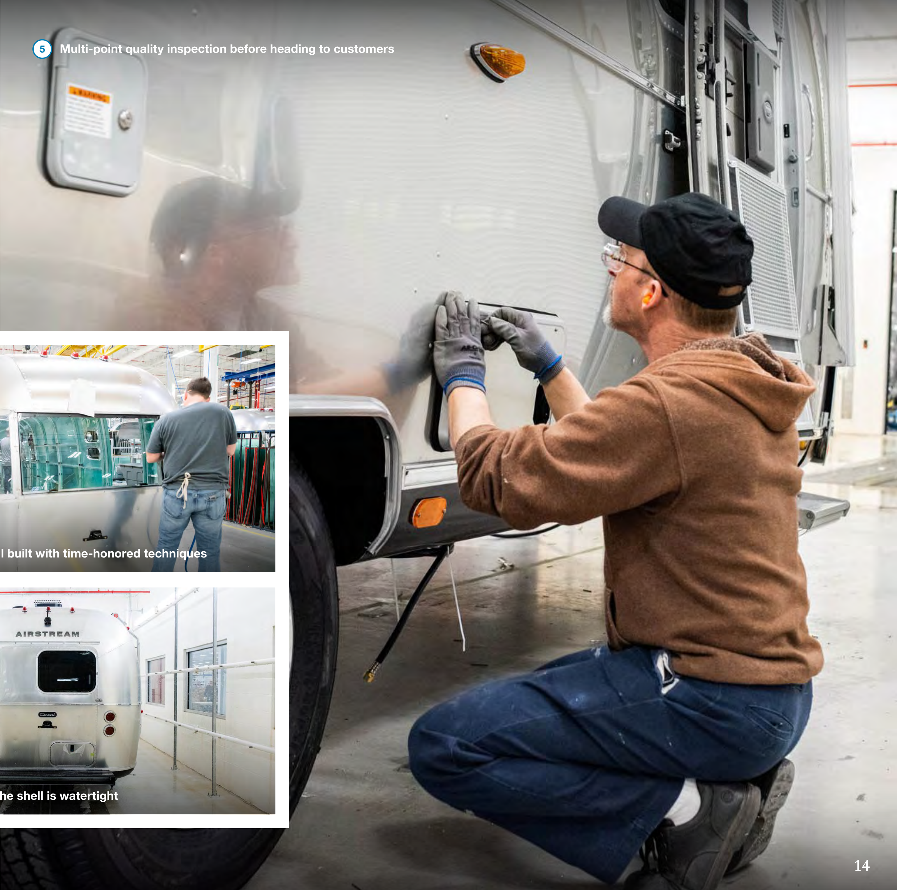
5 Multi-point quality inspection before heading to customers