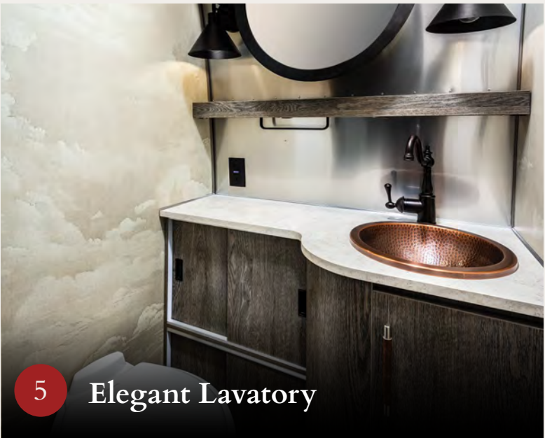
5 Elegant Lavatory Functional and gorgeous for a feeling of calm