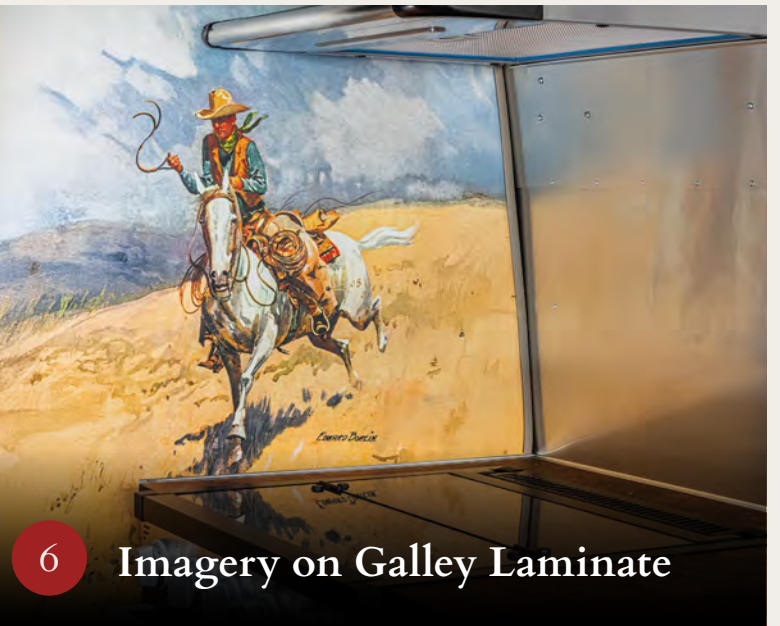
6 Imagery on Galley Laminate Attention to detail, including artwork from historic Stetson advertisements