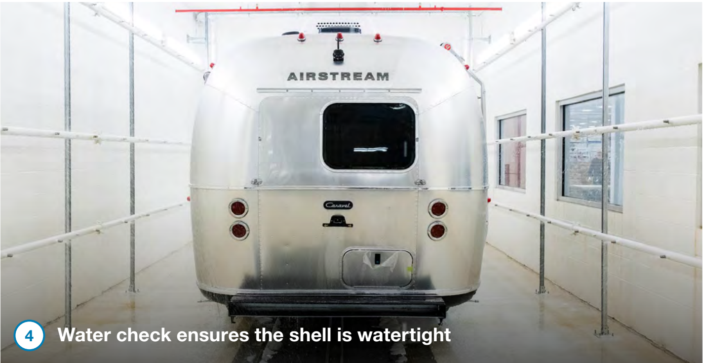
4 Water check ensures the shell is watertight