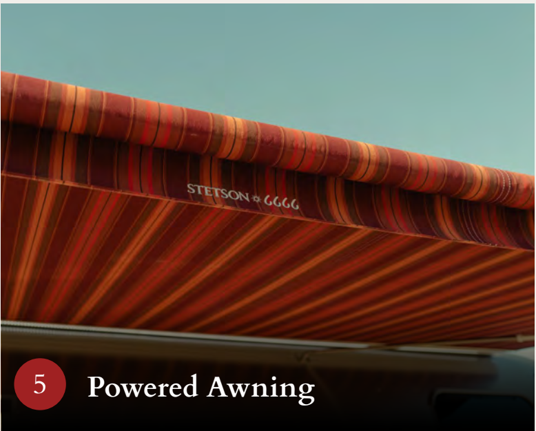
5 Powered Awning

Accented with cowboy imagery drawn from the rugged West