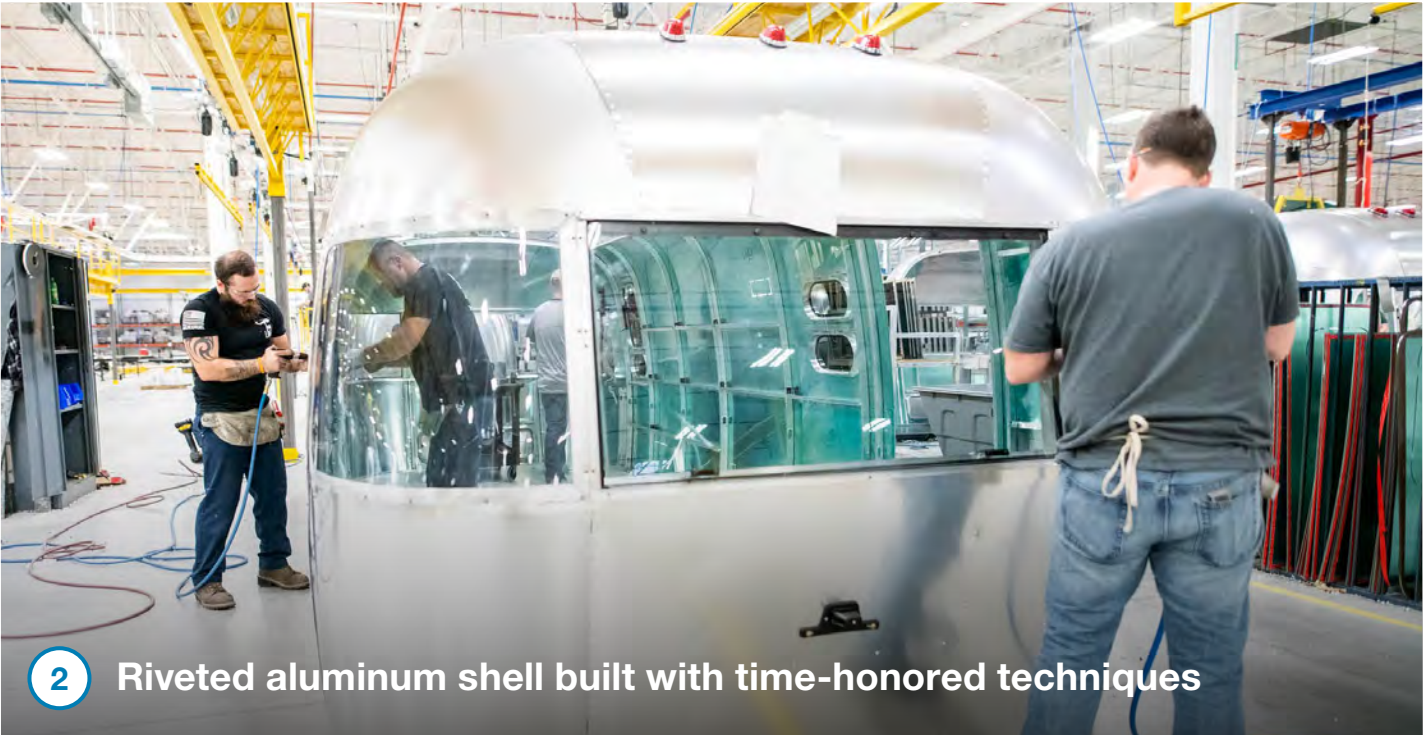
2 Riveted aluminum shell built with time-honored techniques