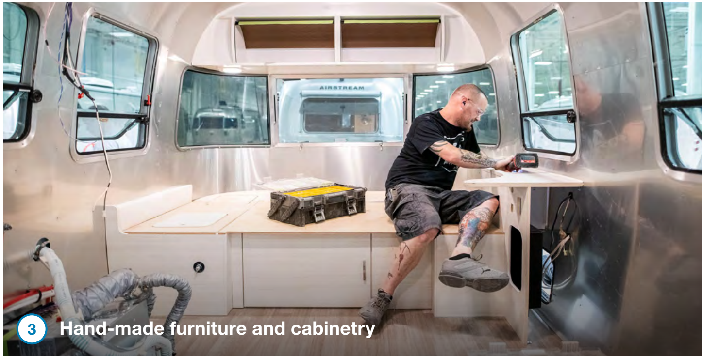
3 Hand-made furniture and cabinetry