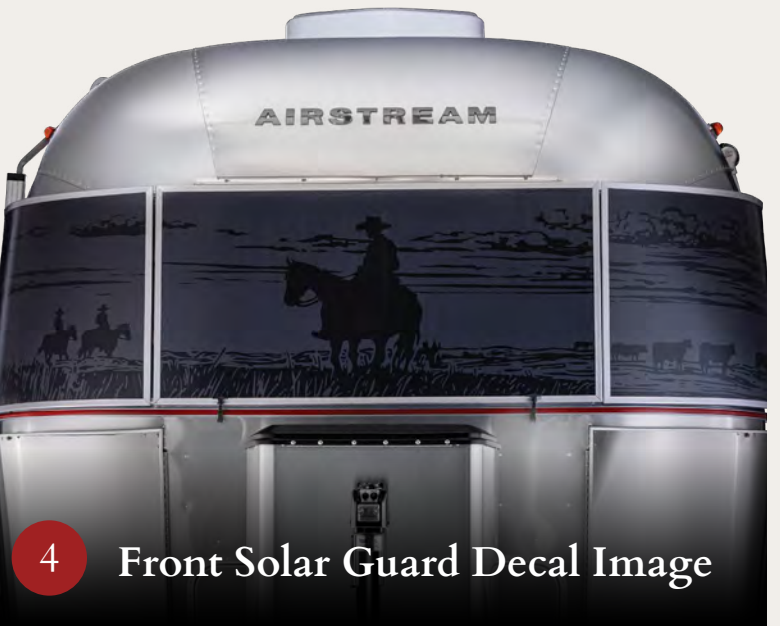
4 Front Solar Guard Decal Image

Featuring Stetson and Four Sixes branding