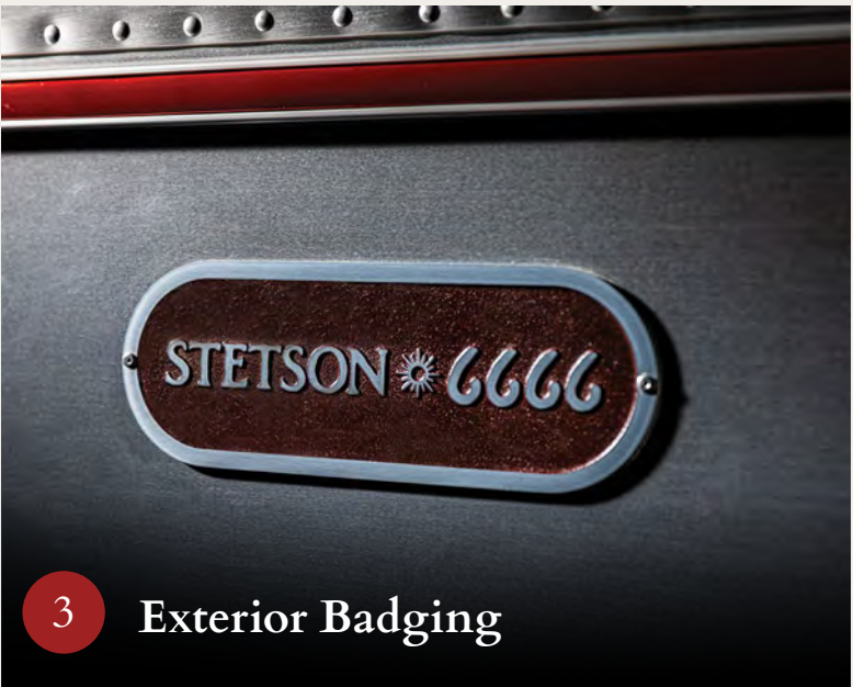
3 Exterior Badging

A pop of color balanced with the traditional Airstream look