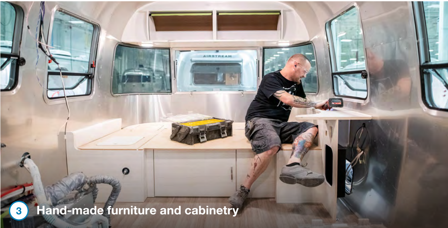
3 Hand-made furniture and cabinetry