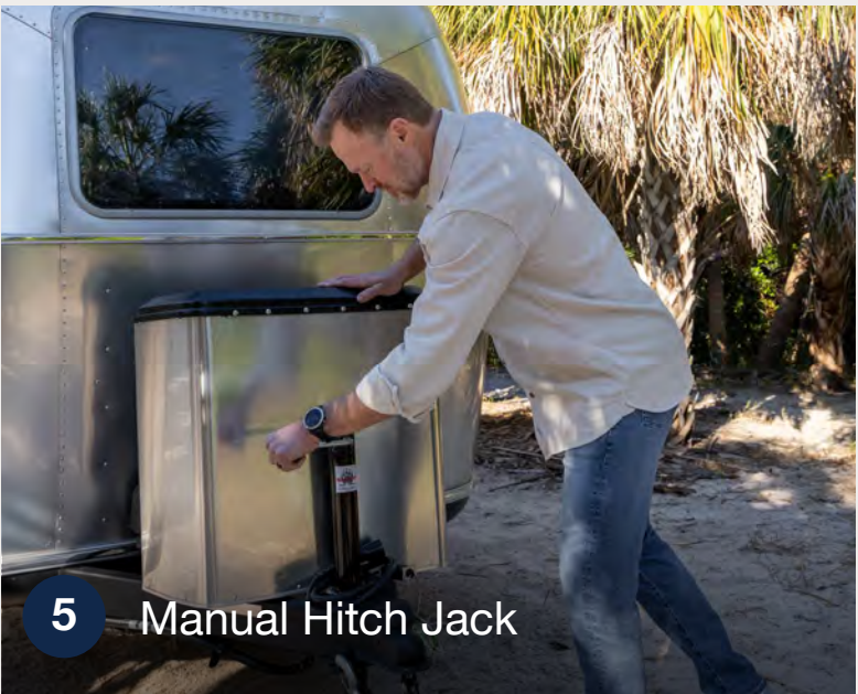
5 Manual Hitch Jack Lightweight feature for quick hitching