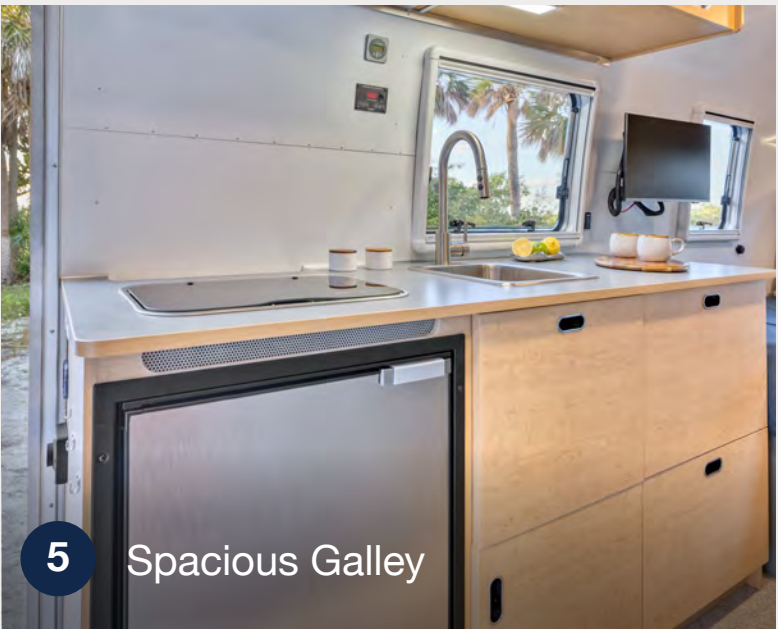
5 Spacious Galley

Dedicated spaces for shower, lavvy sink and fully plumbed toilet