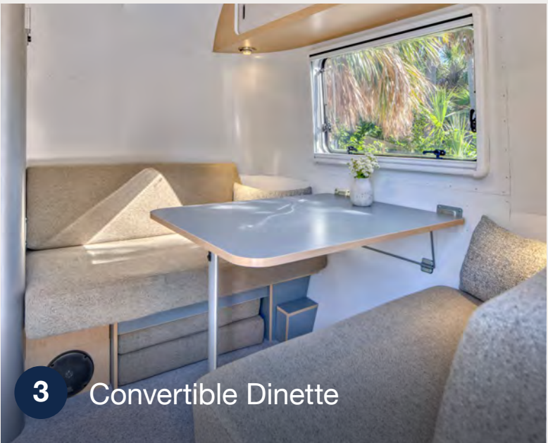
3 Convertible Dinette

Screens, blackout blinds, or open to the world