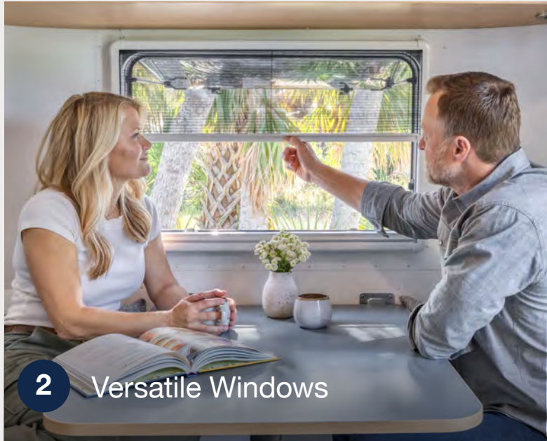
2 Versatile Windows

Screens, blackout blinds, or open to the world