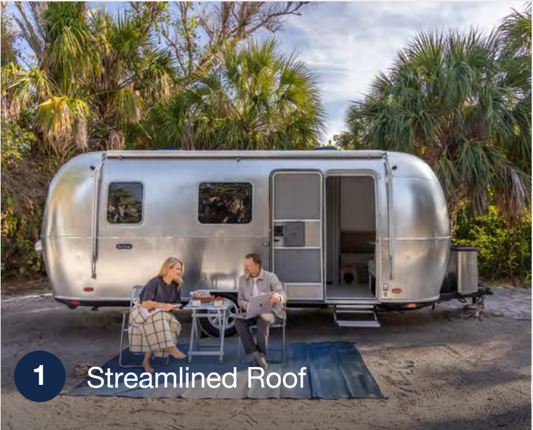
1 Streamlined Roof A/C moves under roadside bed for a clean silhouette