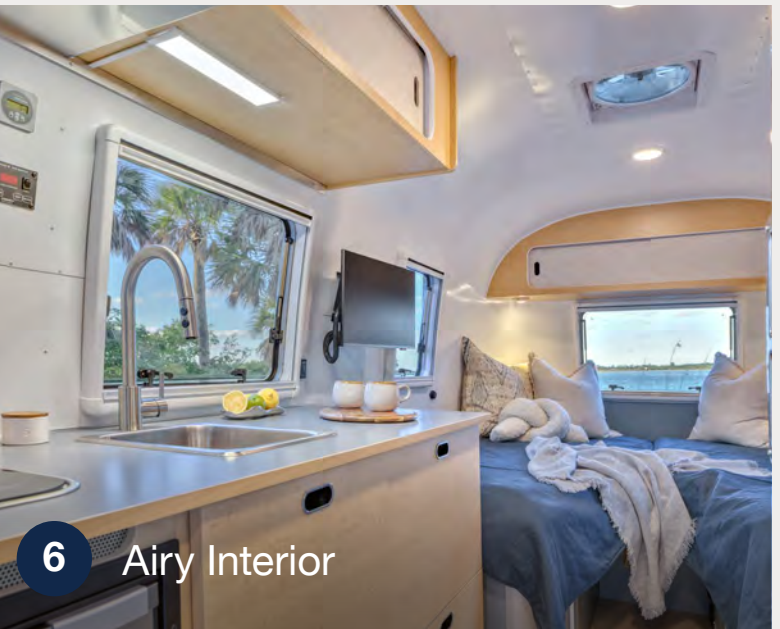
6 Airy Interior

12 V refrigerator, sink, two-burner gas cooktop, and plenty of space to meal-prep