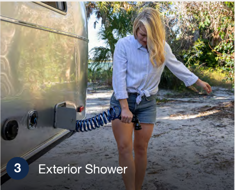
3 Exterior Shower Easy to access hot and cold water to wash off before heading inside