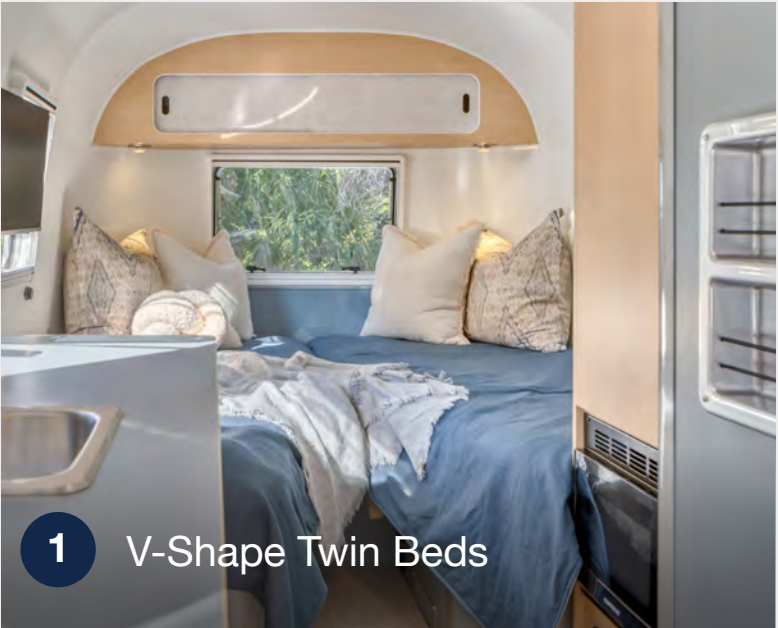
1 V-Shape Twin Beds