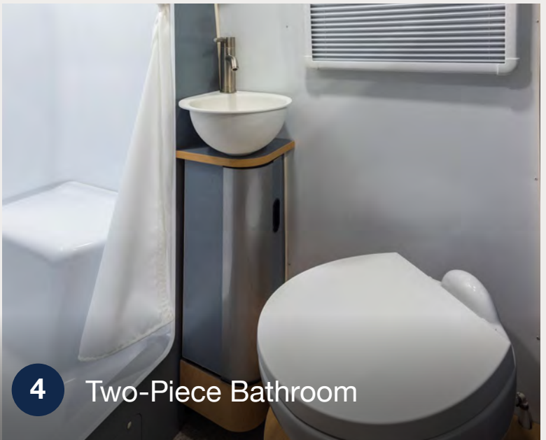
4 Two-Piece Bathroom

Dine at the table, or set up for sleeping or lounging in style