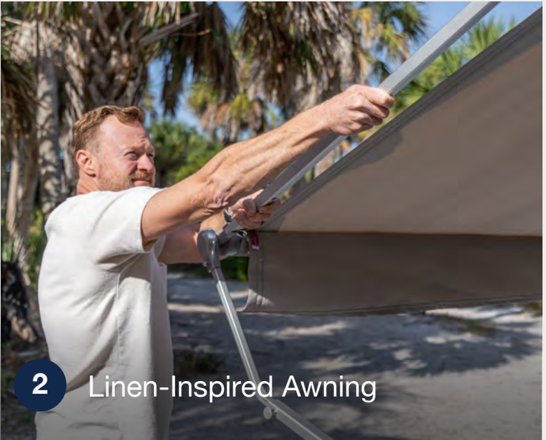
2 Linen-Inspired Awning Manual Zip-Dee awning creates wide foot-print for exterior patio space