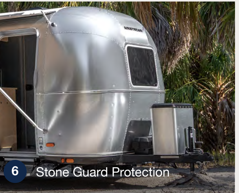
6 Stone Guard Protection 3M film guards against road debris