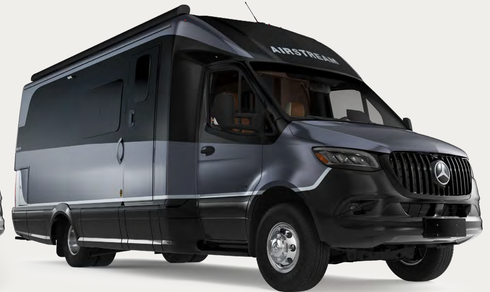
Ultra Premium Tenorite Grey Metallic