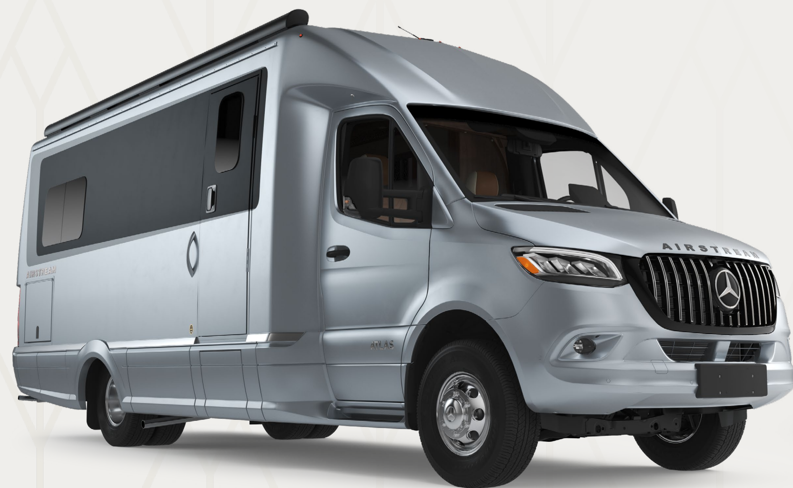
Hightech Silver Metallic

Inspired by Airstream Heritage The paint design subtly reflects the curves of Airstream travel trailers, connecting modern styling with iconic DNA.