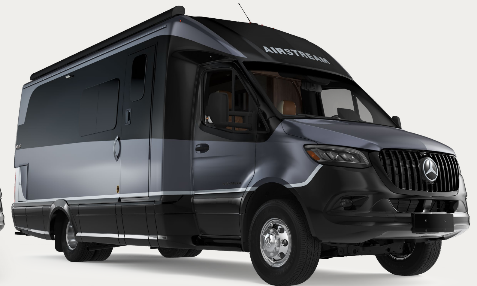
Ultra Premium Tenorite Grey Metallic