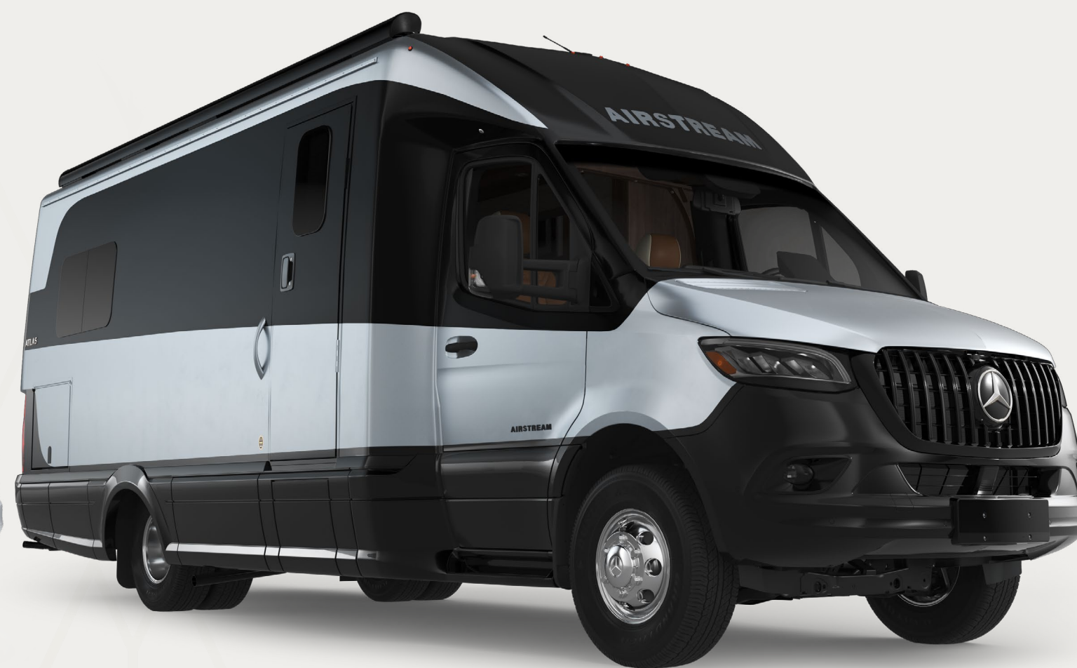
Ultra Premium Hightech Silver Metallic