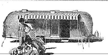
Airstream—since 1932 the world's finest lightweight travel trailers

Unusual "comfort and easy living" features have been added to the sensational Overlander to provide a special sleep-two model for those who want to accommodate just a fun-loving twosome. The interior has been designed to give you maximum living area and the luxurious feeling of home. Everything in the standard Overlander is here, but just more so, including the famous features that make Airstream the ultimate in travel trailers . . . a large living room area with deluxe lounge beds; a larger bathroom with tub, shower, wash basin and toilet; a uniquely arranged galley with extra large working and formica area; worlds of closet and storage space; spacious combination refrigerator; apartment size stove—and many other exciting features too. Everything you need for comfortable living and traveling is in this Airstream. So stop dreaming and start living—put yourself on the road to fun, excitement and adventure.